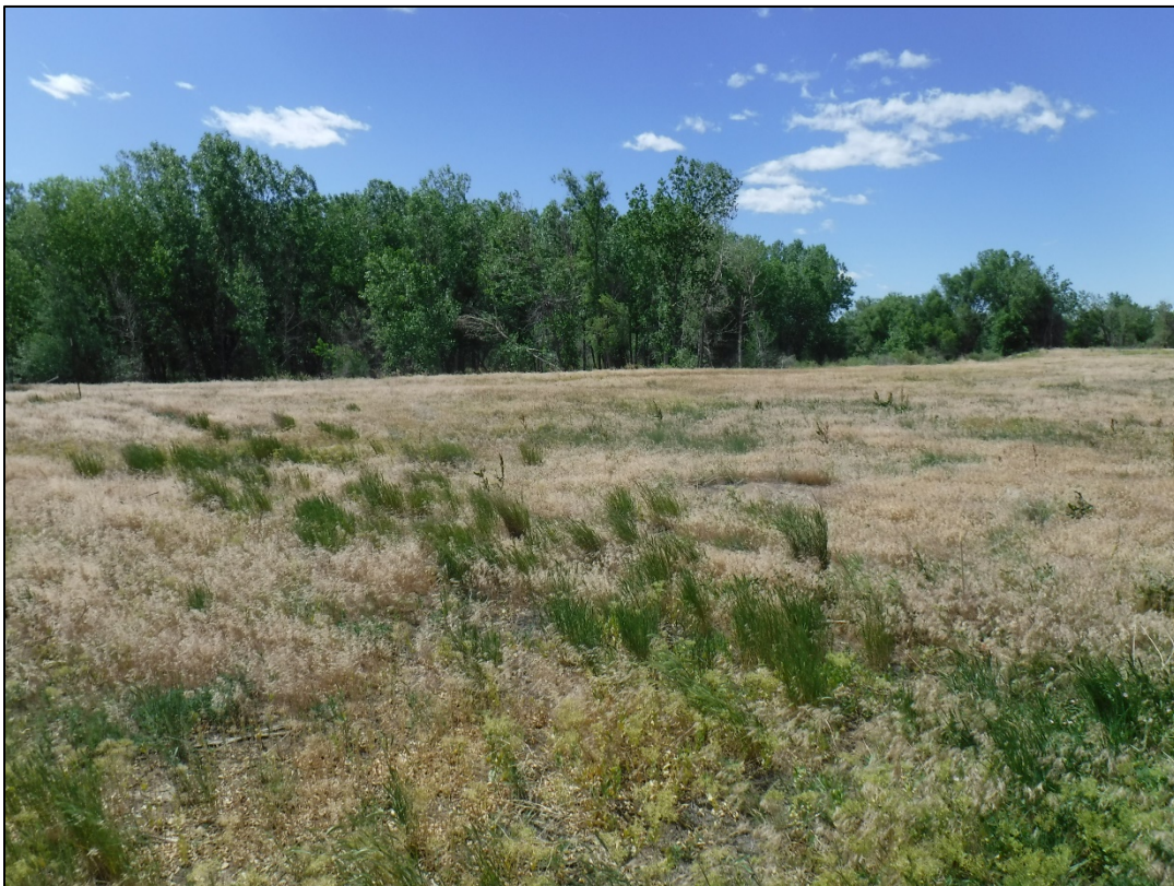
Photo 6: Looking west along the southern boundary of release area.