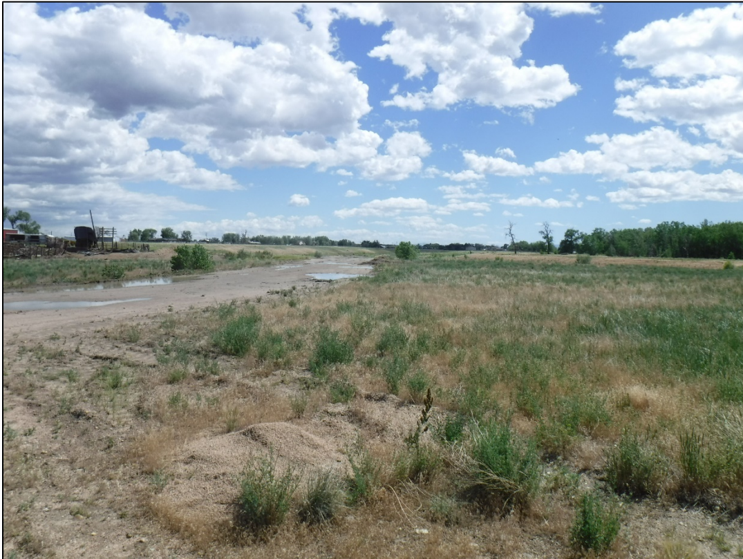
Photo 1: Looking south, haul road center left of picture, area to be release to right of picture