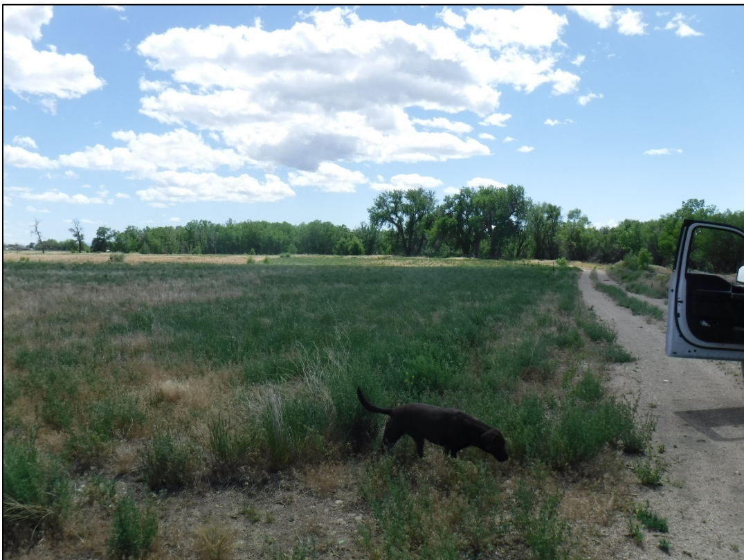
Photo 2: Looking south along access road, to be used for construction