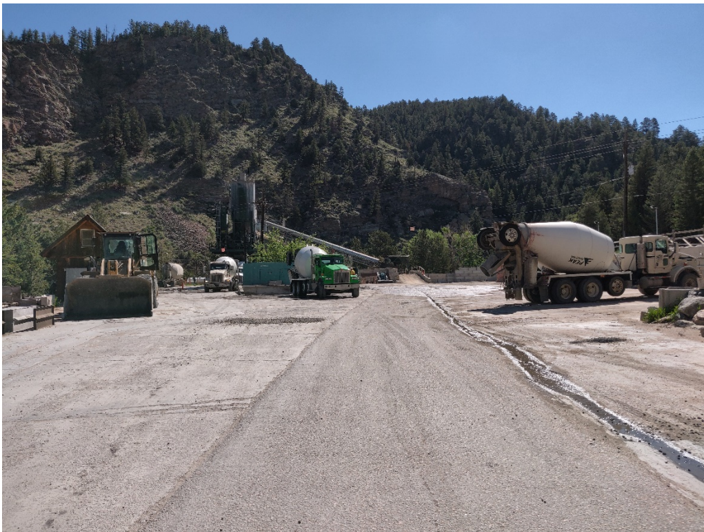
View of Stage Z from the west side looking east