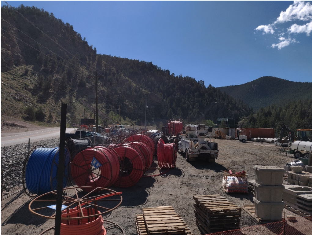
View of Stage X from the northwest corner looking east