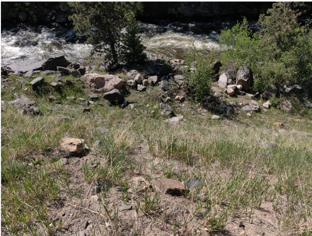
View of vegetation in Stage X looking south down the slope