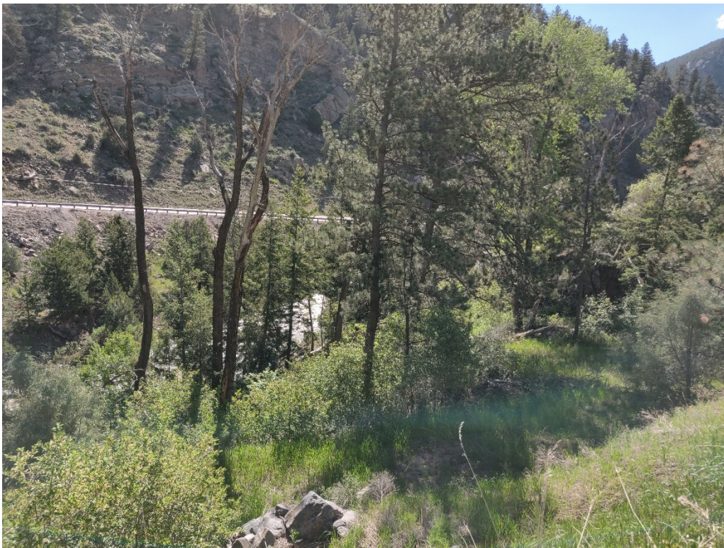
View of existing vegetation east of the batch plant in Stage Z looking northeast