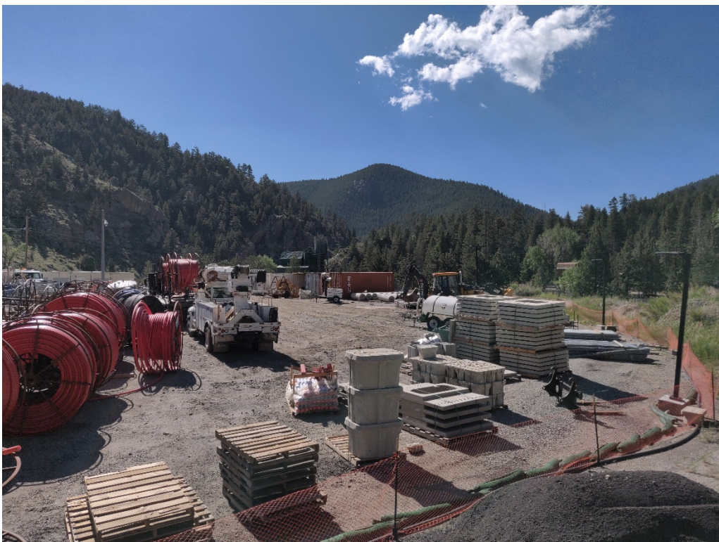
View of Stage X from the northwest corner looking southeast