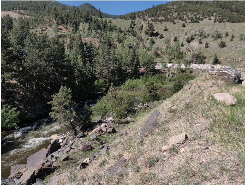
View of vegetation in Stage X looking southwest from east side of the stage