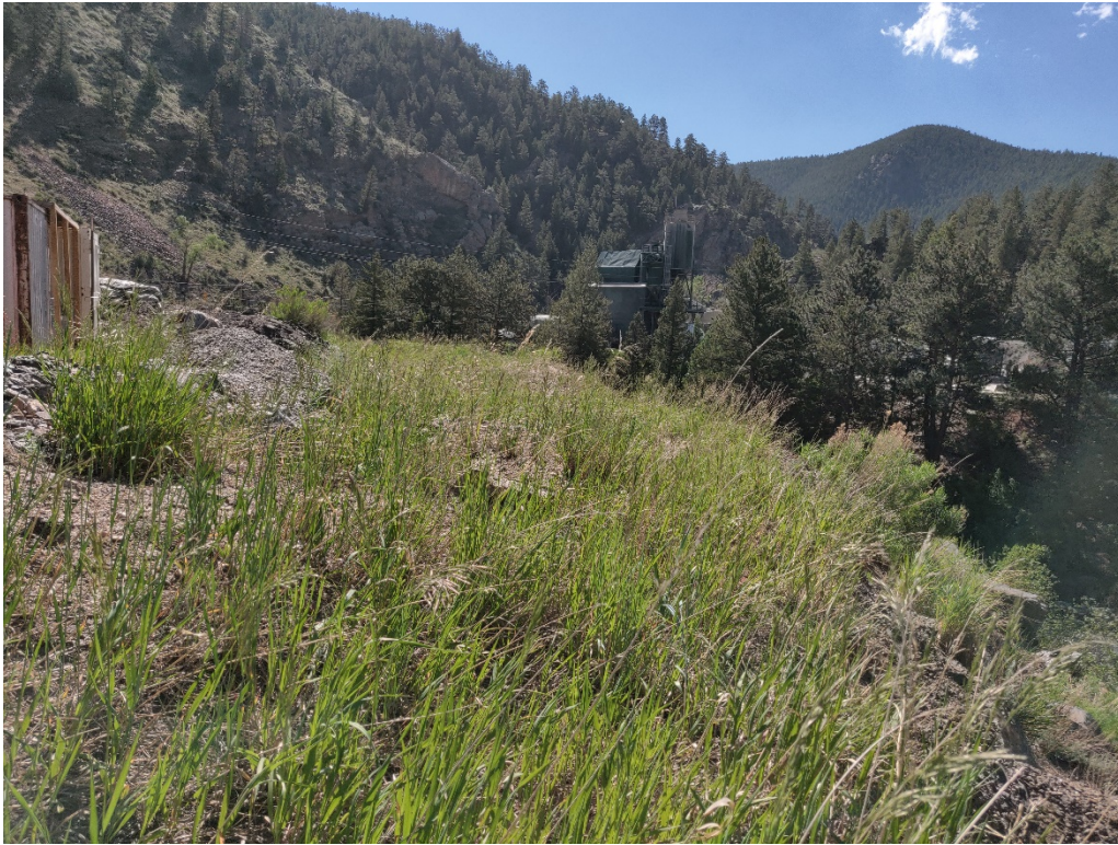
View of vegetation in Stage X looking east