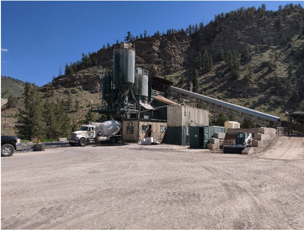
View of concrete batch plant in Stage Z