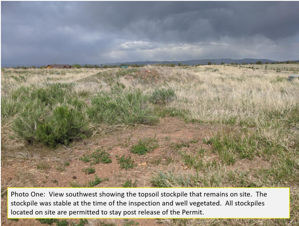
Photo One: View southwest showing the topsoil stockpile that remains on site. The stockpile was stable at the time of the inspection and well vegetated. All stockpiles located on site are permitted to stay post release of the Permit.