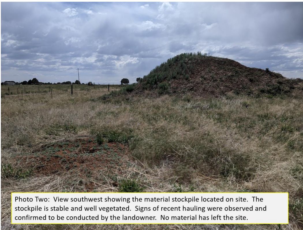
Photo Two: View southwest showing the material stockpile located on site. The stockpile is stable and well vegetated. Signs of recent hauling were observed and confirmed to be conducted by the landowner. No material has left the site.