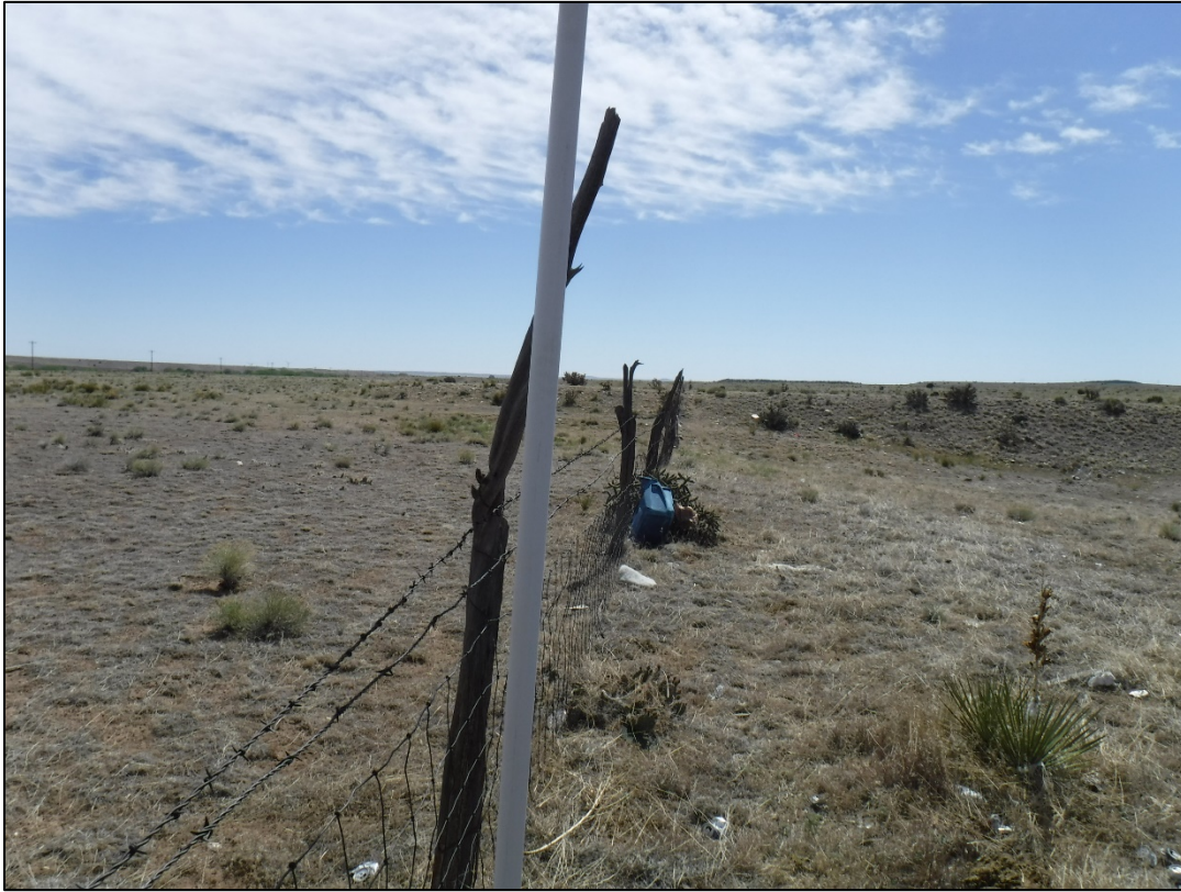
Photo 3: Typical permit boundary marker, pictured is the northwest corner east of residence