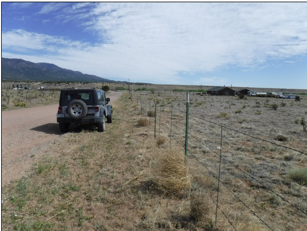
Photo 2: Looking north along the western permit adjacent to County Road 614