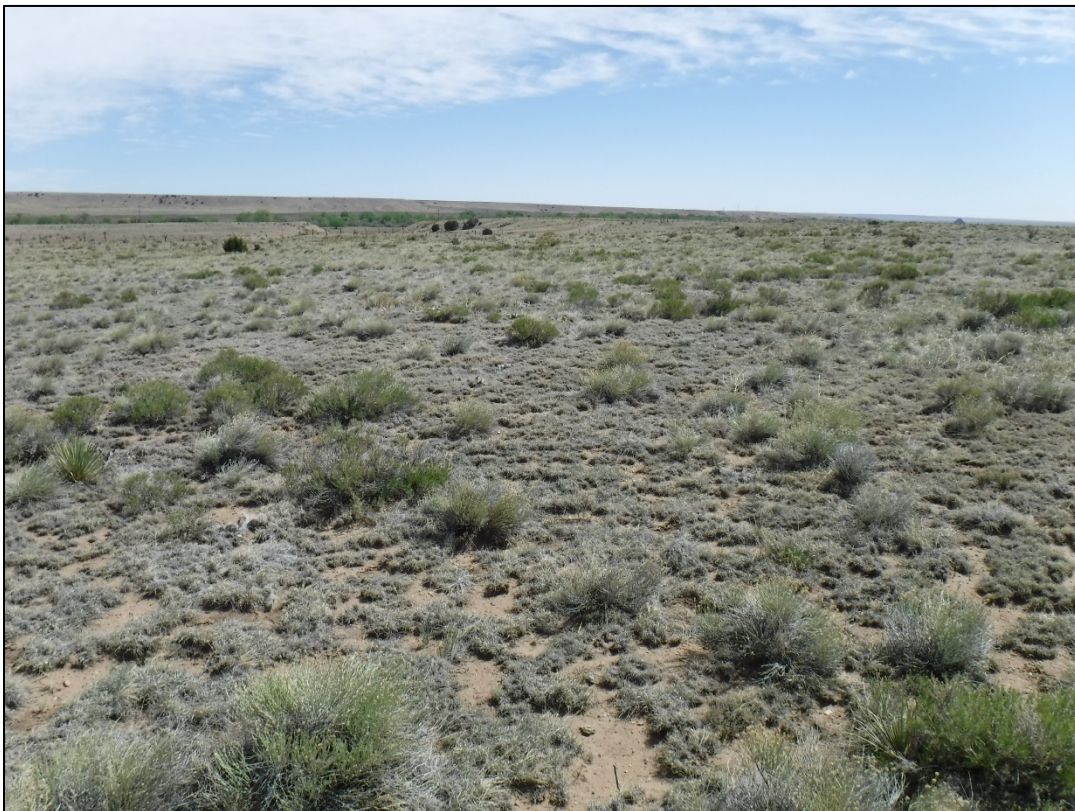
Photo 4: Typical vegetation found at the site and surrounding land