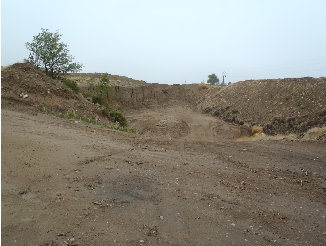
Photo 1. Primary backfill area for imported material (NE corner of site, looking NW).