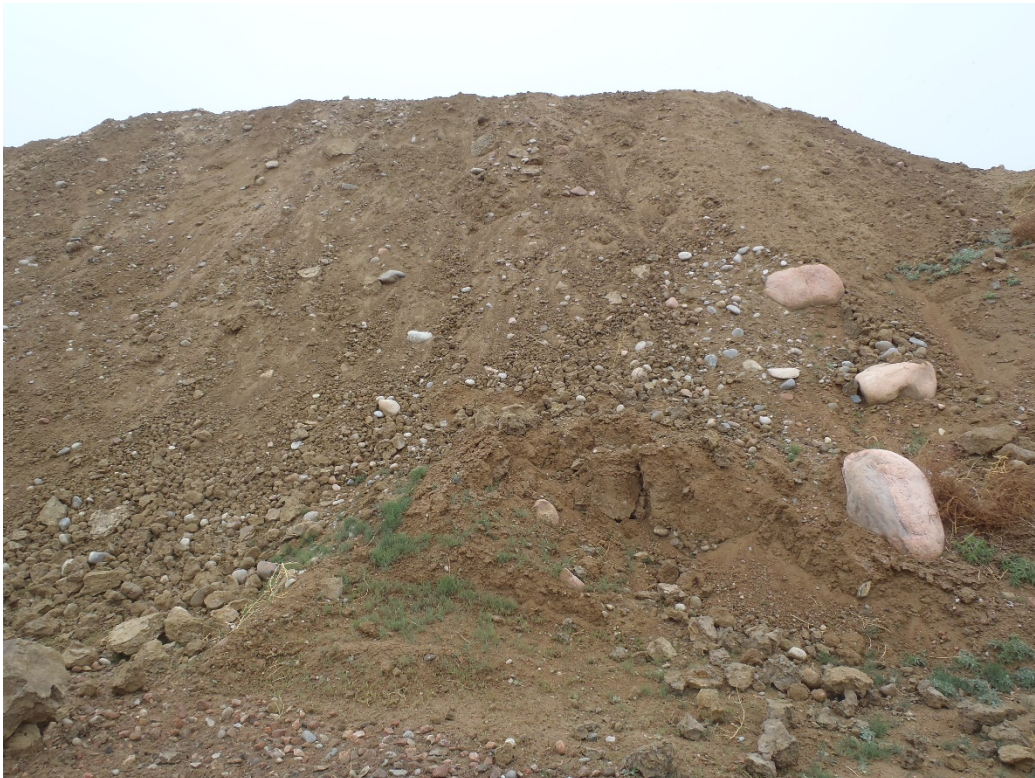
Photo 2. Secondary backfill area for imported material (east side of site, looking north).