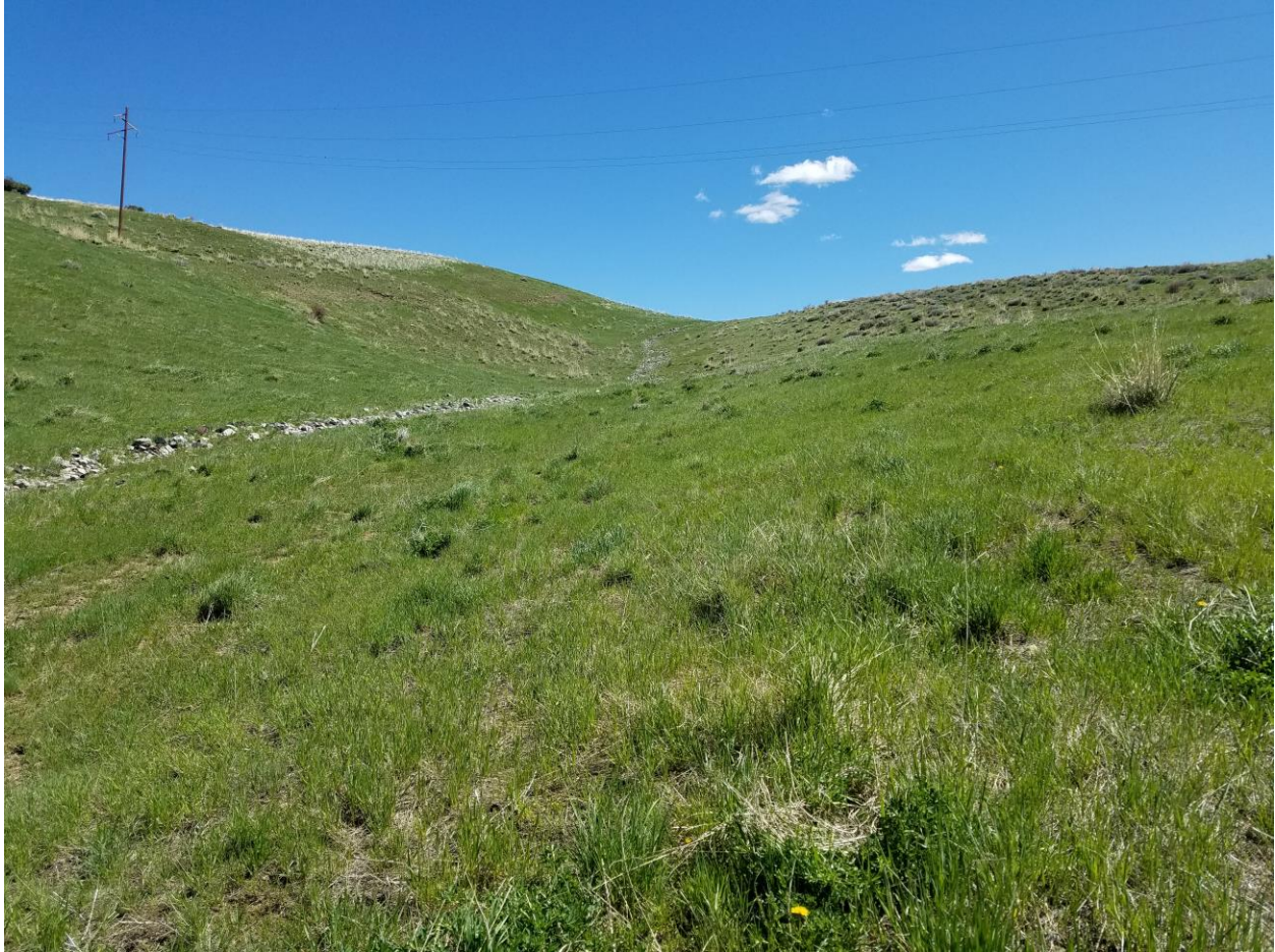
Figure 4. 006-NE4 drainage basin.

Number of Partial Inspection this Fiscal Year: 8