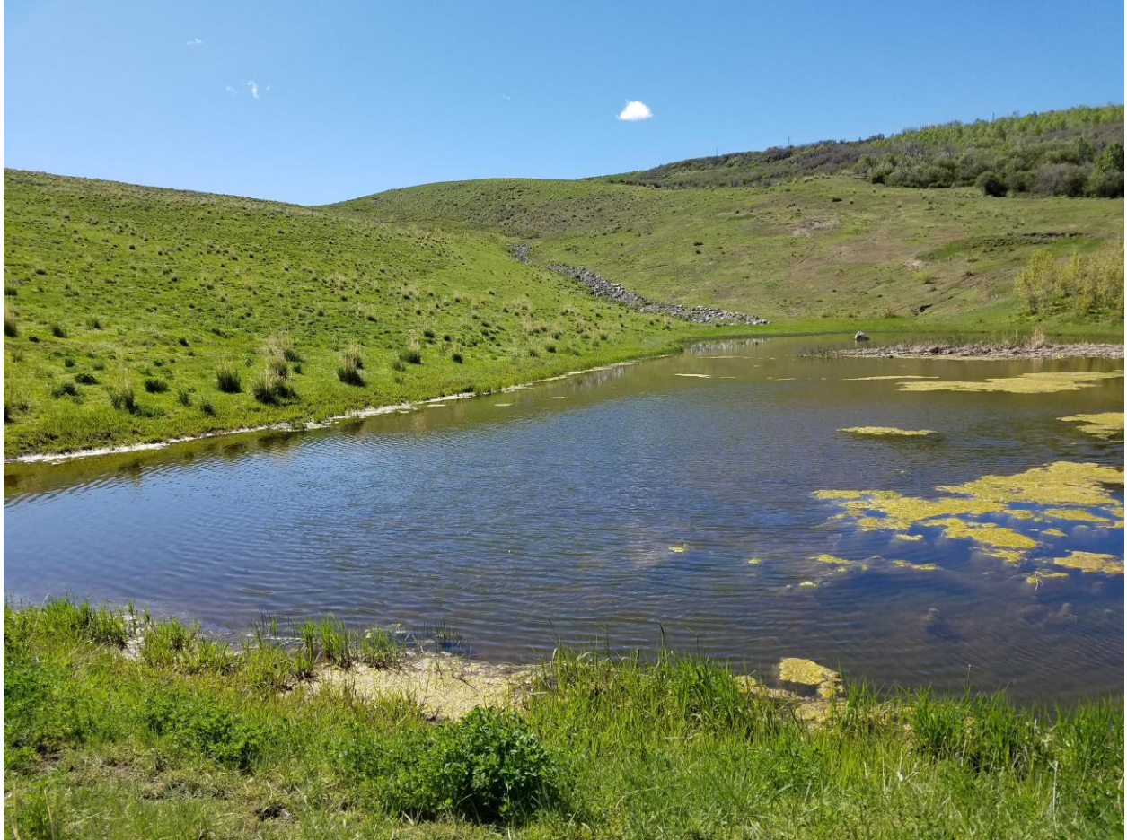
Figure 3. Stock pond T-18 and 005-GULCH drainage basin.

Number of Partial Inspection this Fiscal Year: 8