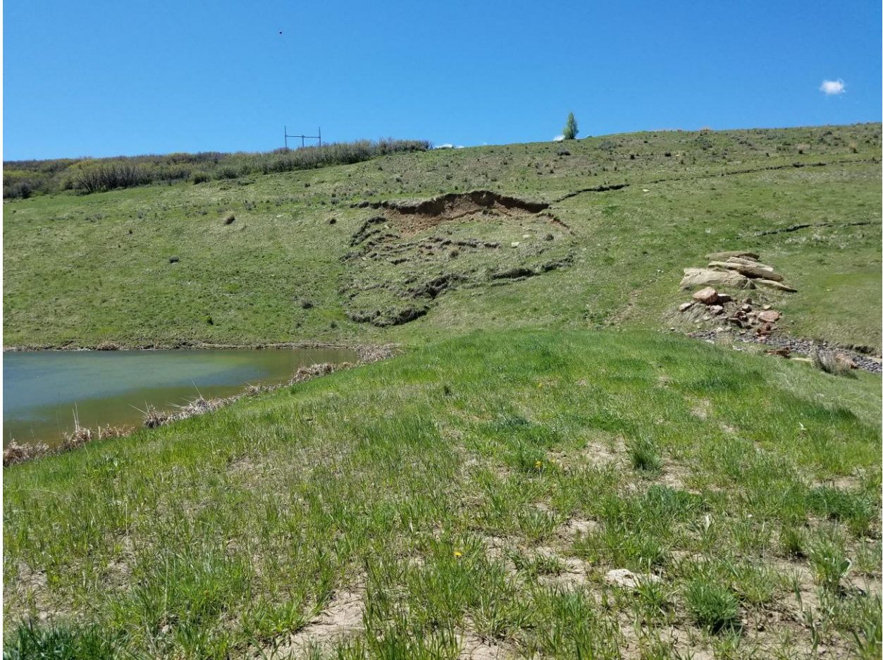
Figure 6. Slump above Pond 006.

Number of Partial Inspection this Fiscal Year: 8