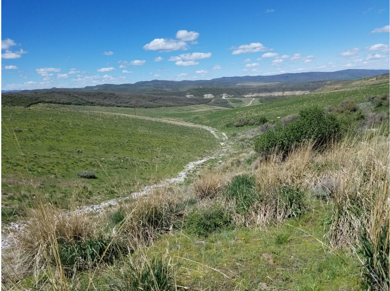
Figure 5. 006-E1 drainage basin.

Number of Partial Inspection this Fiscal Year: 8