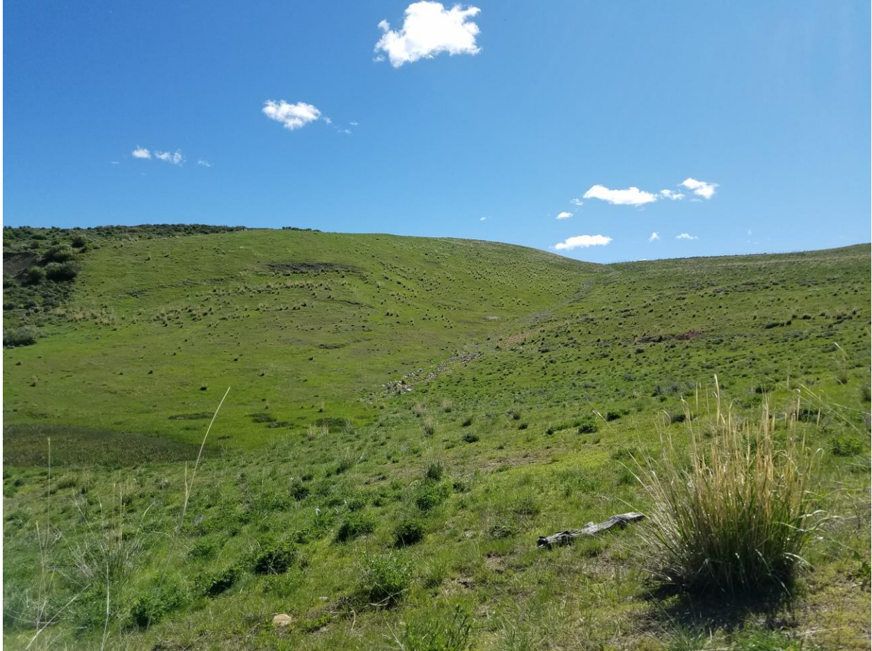
Figure 2. 005-E1 Drainage Basin

Number of Partial Inspection this Fiscal Year: 8