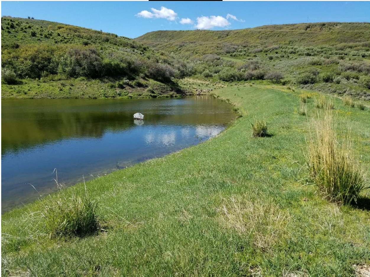
Figure 1. Pond 005

Number of Partial Inspection this Fiscal Year: 8