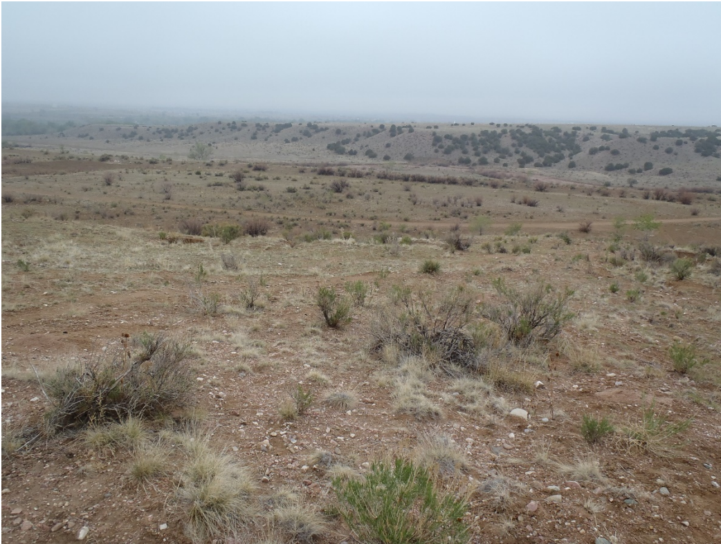
Photo 3. Slope west of terrace (looking WSW, towards Eightmile Creek).