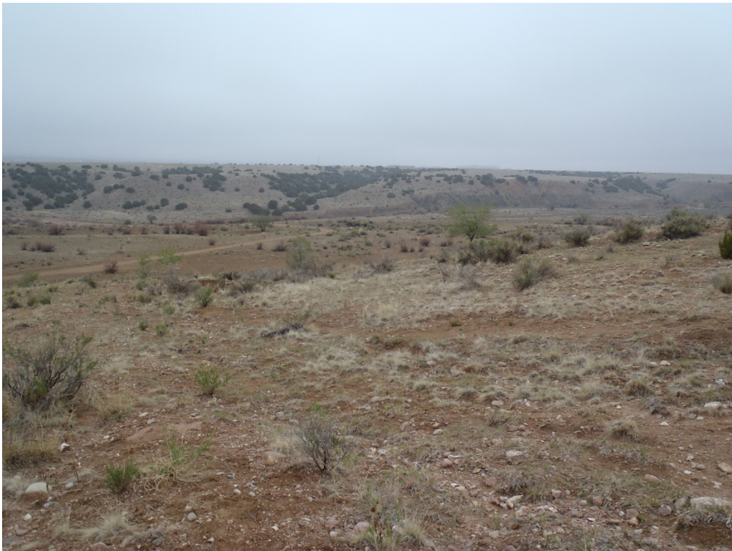
Photo 4. Slope west of terrace (looking NW, towards Eightmile Creek).