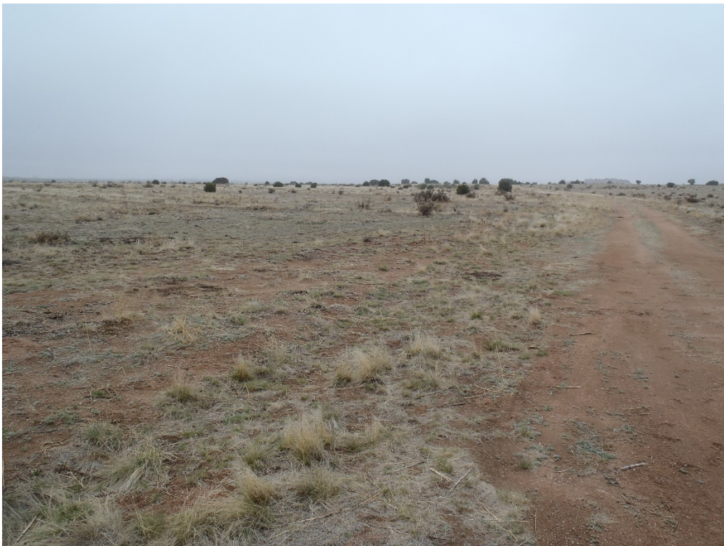
Photo 2. Terrace area, two track near the east boundary of Phase 1 (looking north).