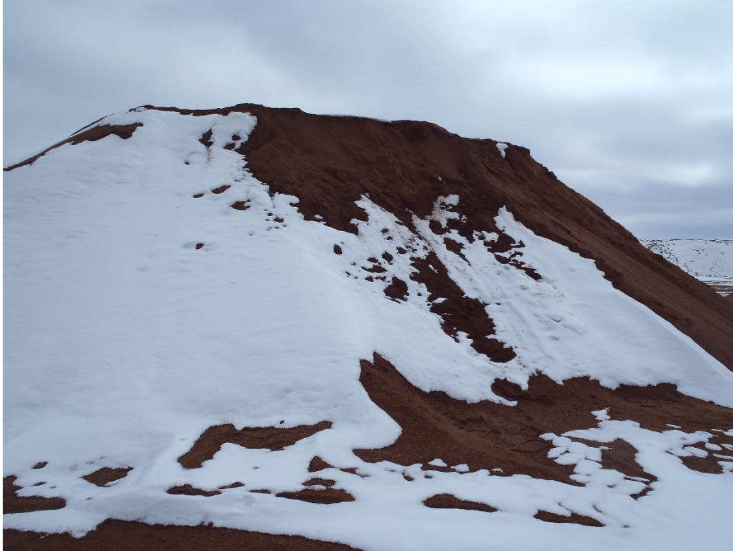
Photo 1. One observed overburden stockpile.