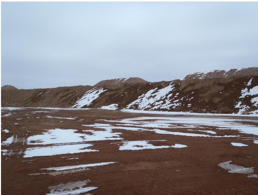
Photo 7. Topsoil stockpile on east side of working area.