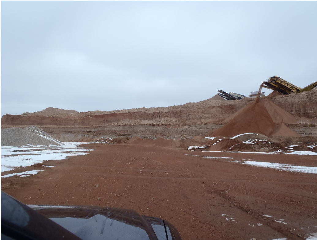
Photo 2. North end of active highwall and operating screen plant (looking NE).