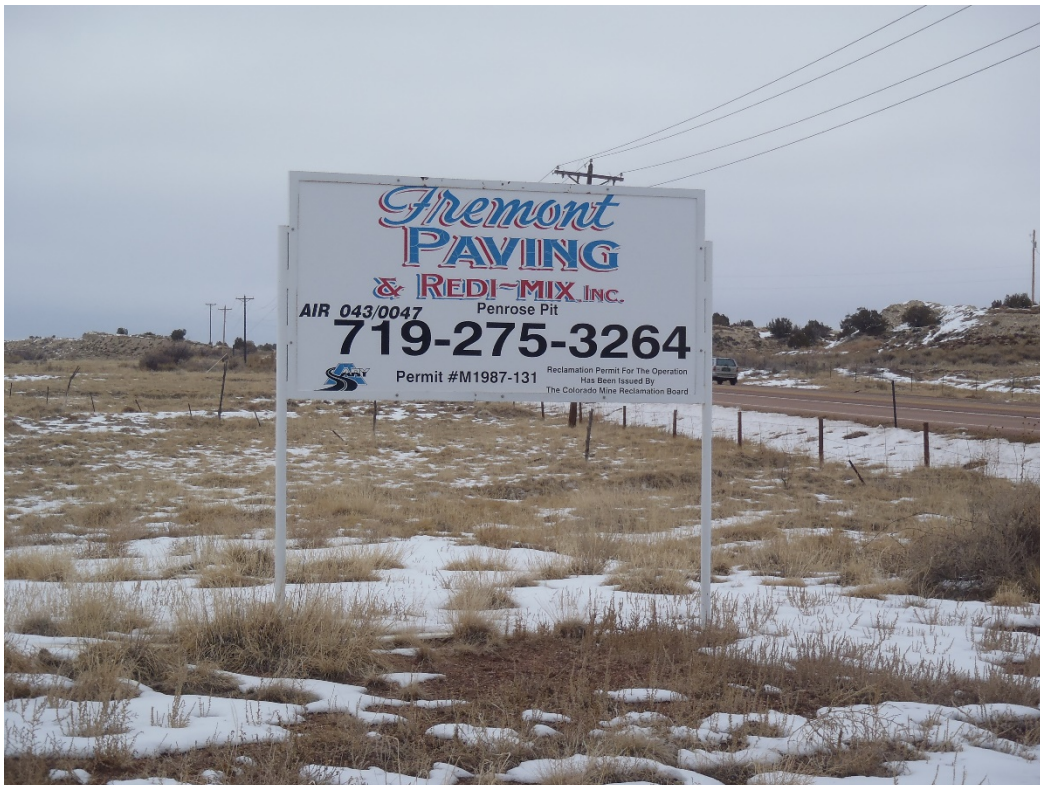
Photo 5. Permit sign near entrance from Hwy 115.