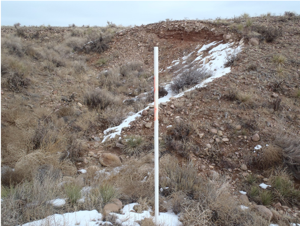
Photo 6. One of two observed affected area boundary markers (between Phase 4 and 5).