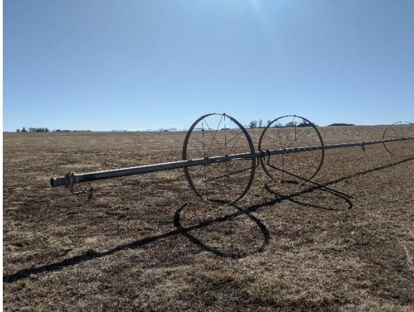
Photo 5: NW corner Irrigated cropland Morgan property No rilling or pooling of water