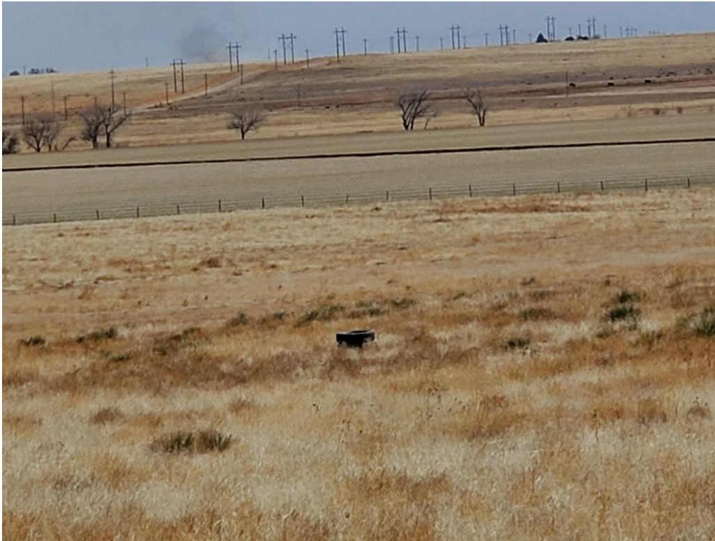
Photo 3: Boundary marker and vegetation on eastern side of the permitted area.