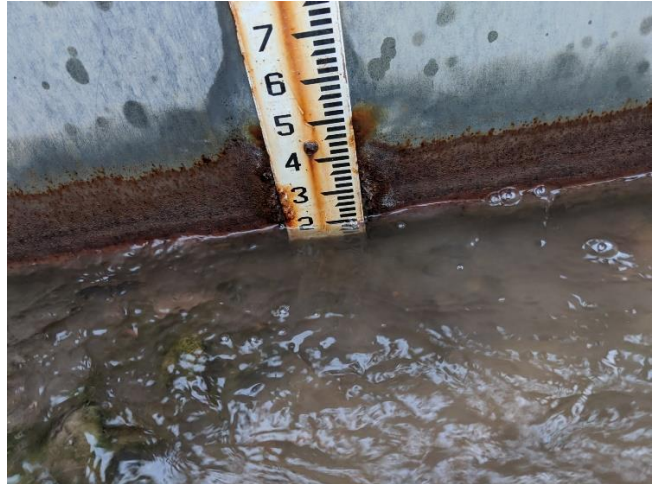
Streeter Pond flume measurement.