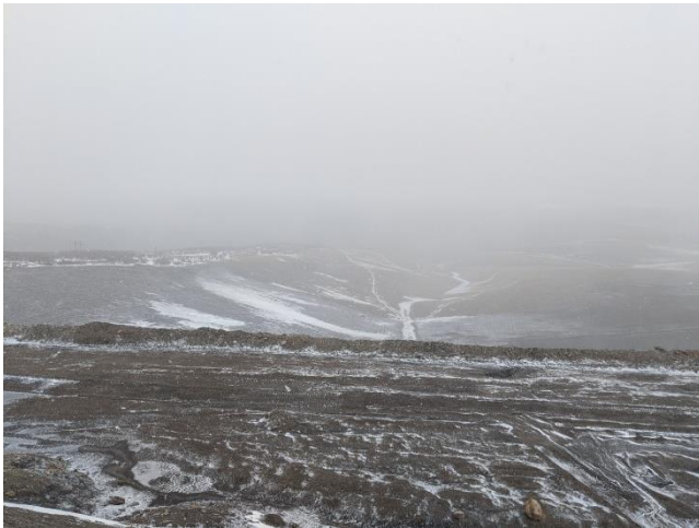
West Pit Reclamation.

The regrade and reclaimed slopes of the East and West Pit remain stable.