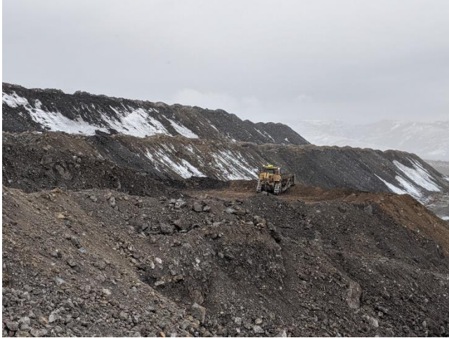
Collom Temporary Spoil Pile.