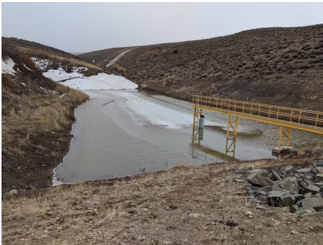
Section 25 Pond.