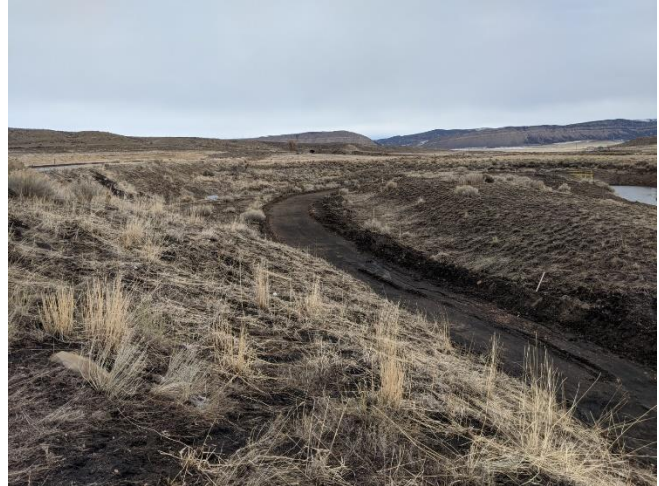
Stoker temporary maintenance road.