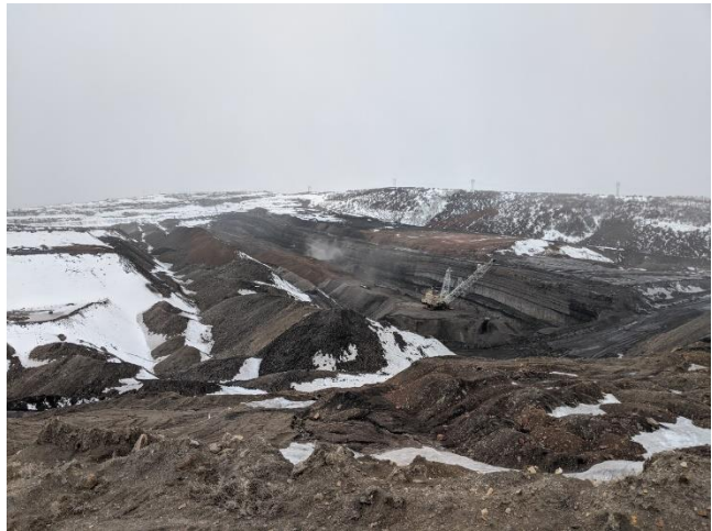
South Taylor Pit – west end.