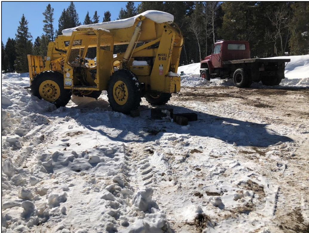
Photo 4. View looking southwest across 93 Mine claim, showing this property currently being used for truck/equipment storage for landowner's excavav.