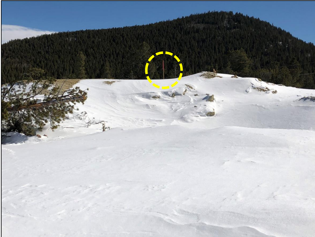
Photo 7. View looking east across top of historic waste rock pile, which appeared to be undisturbed by the operation. Note wooden stake (circled in background) marking boundary between 93 Mine claim (at left) and Golden Cloud Mine claim (at right).