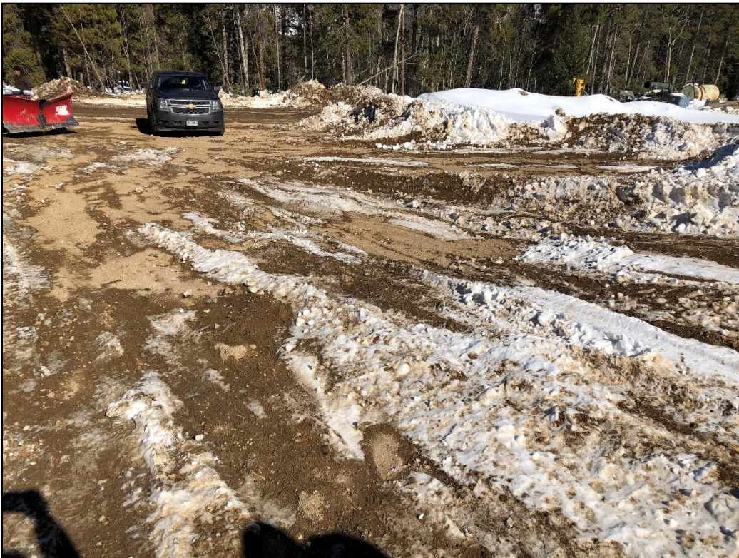
Photo 6. View looking north across 93 Mine claim which was leveled for use as storage for landowner's excavation company.