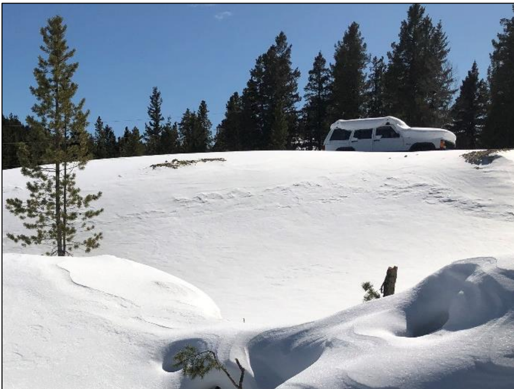
Photo 8. View looking south at Golden Cloud Mine claim, showing SUV parked on top of historic waste rock pile.