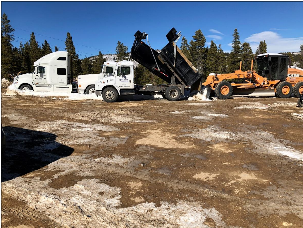
Photo 2. View looking north across 93 Mine claim, showing this property currently being used for truck/equipment storage for landowner's excavation company.