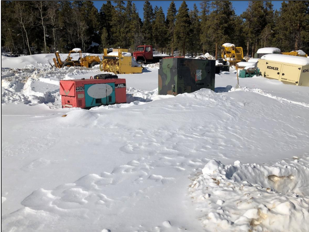
Photo 5. View looking west across 93 Mine claim, showing this property currently being used for truck/equipment storage for landowner's excavation company.