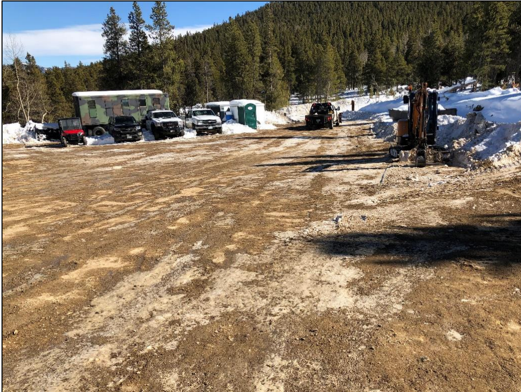
Photo 3. View looking northeast across 93 Mine claim, showing this property currently being used for truck/equipment storage for landowner's excavation company.