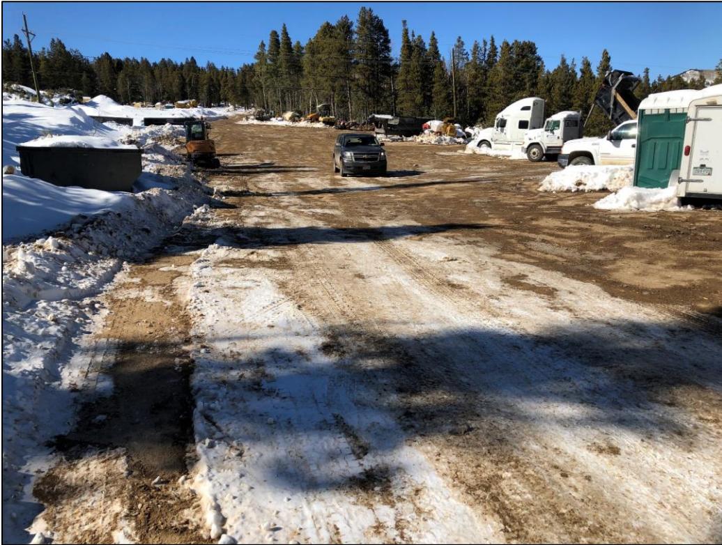
Photo 1. View looking southwest across 93 Mine claim from access road off Virginia Canyon Road. Note this property is currently being used for truck/equipment storage for landowner's excavation company.