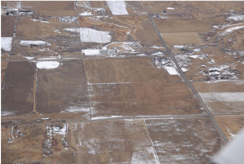
Photo 4: North is at bottom of photo: Parcel DP-1, IP1, IP-2, and IP3 are in foreground.

Number of Partial Inspection this Fiscal Year: 5