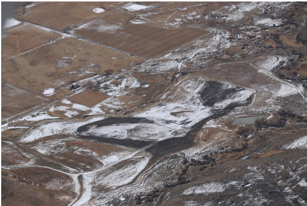
Photo 2: final pit area. Pond 13 is at right of photo. Pond 15 is towards center of photo

Number of Partial Inspection this Fiscal Year: 5