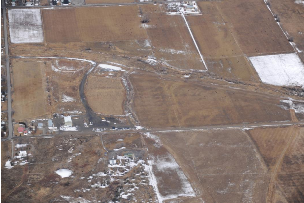
Photo 3: ERMR office, warehouse, facilities area, and pond 18 at center left of photo.