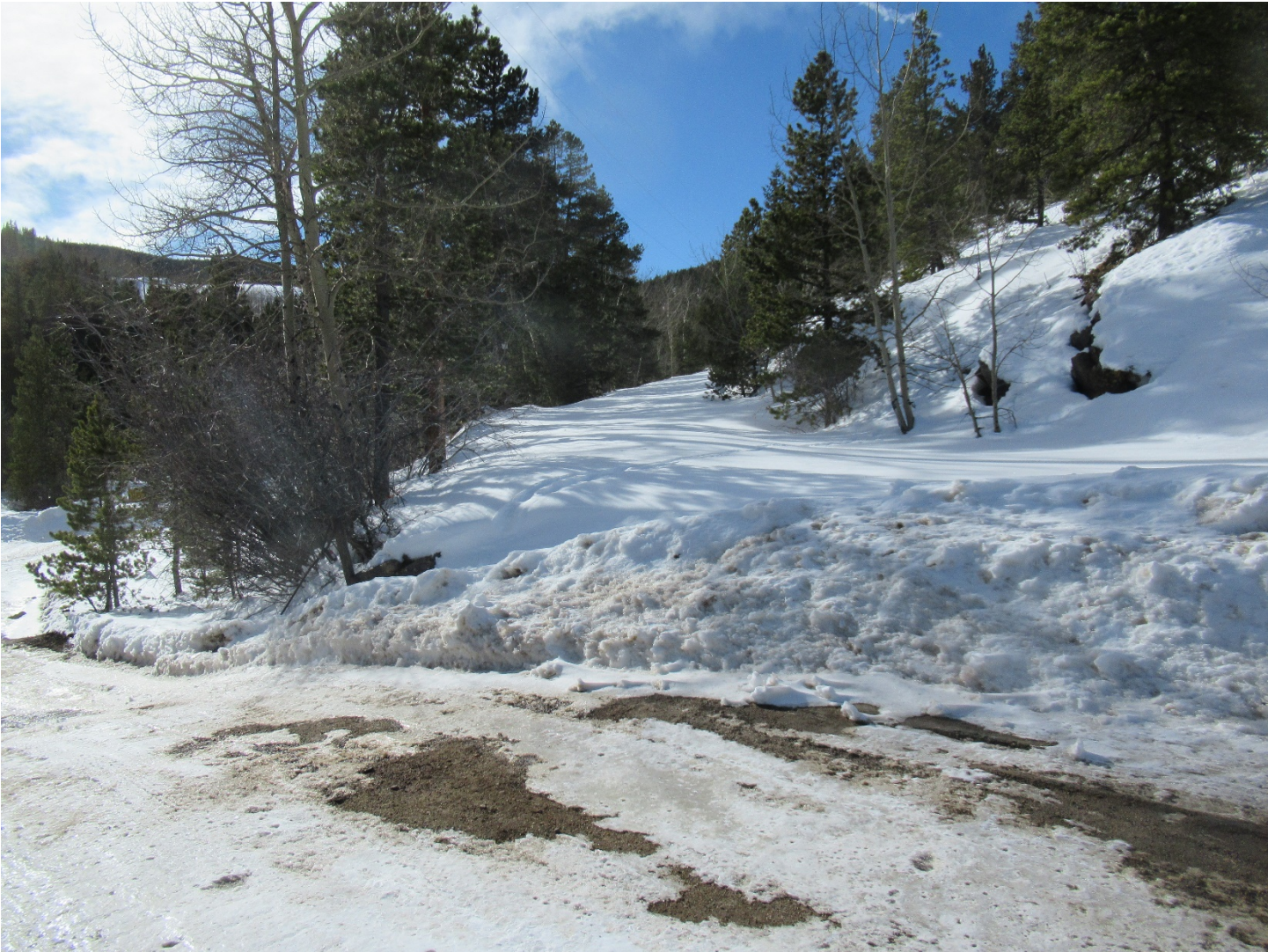
View of the unplowed Trail Creek Road from the last residence looking east