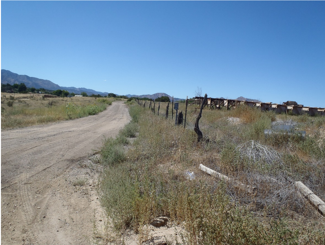
Photo 4. South permit boundary markers.