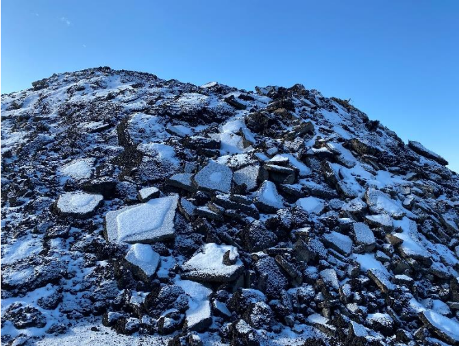
Asphalt Stockpile- to be recycled