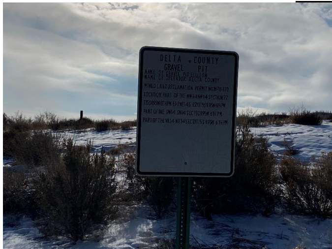
Mine ID Sign