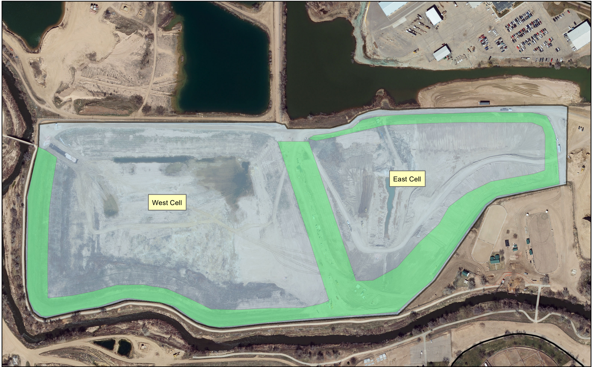
Geisert Pit M-1978-210 2020 Annual Report Site Map