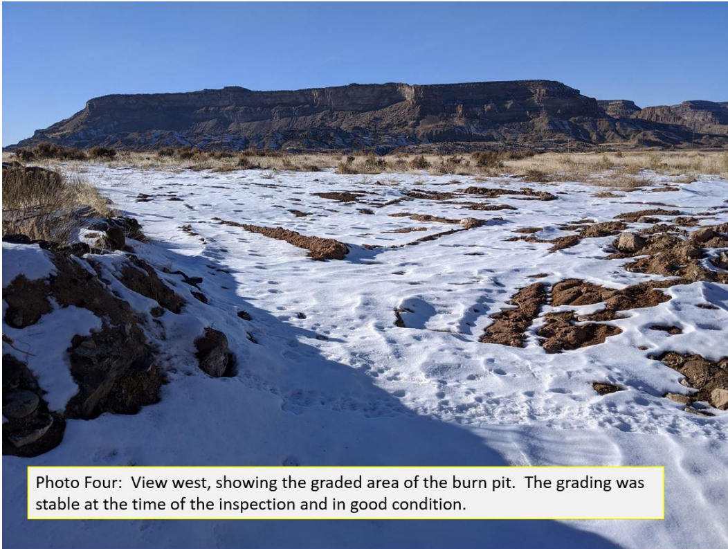
Photo Four: View west, showing the graded area of the burn pit. The grading was stable at the time of the inspection and in good condition.