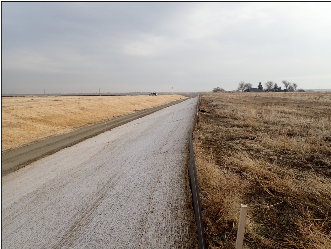
Photo 6. Storm water channel along southern edge of affected lands; looking east.