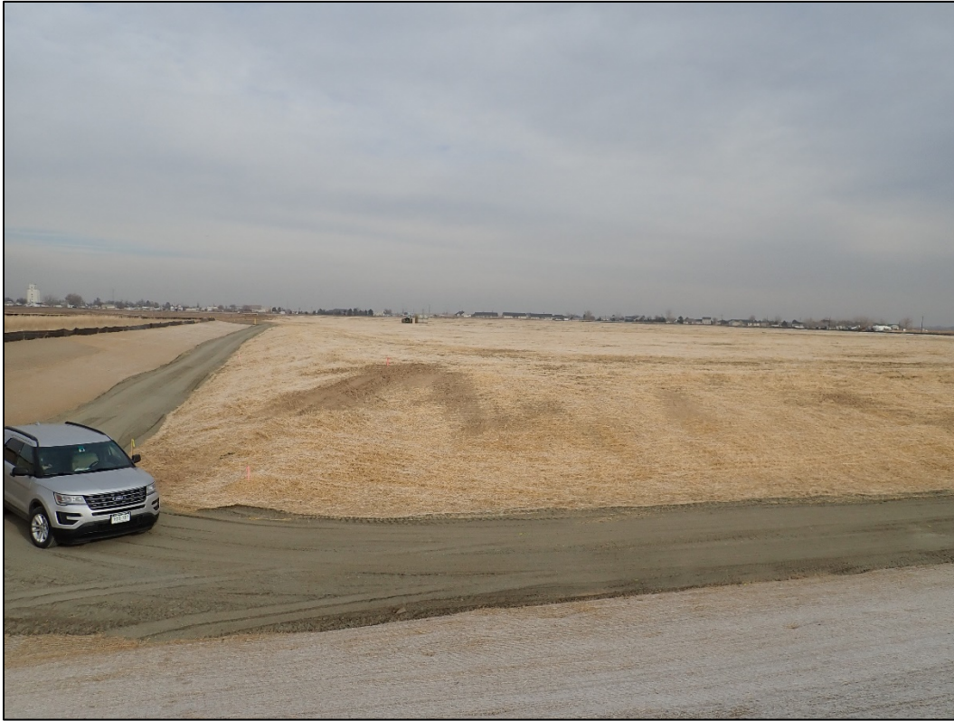
Photo 5. Southwest corner of Parcel 2 where the storm water channel turns from south to east; looking north.