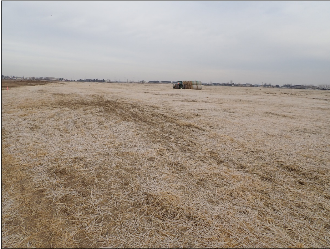
Photo 3. Sample photo of large borrow area which has just been mulched; looking northeast.