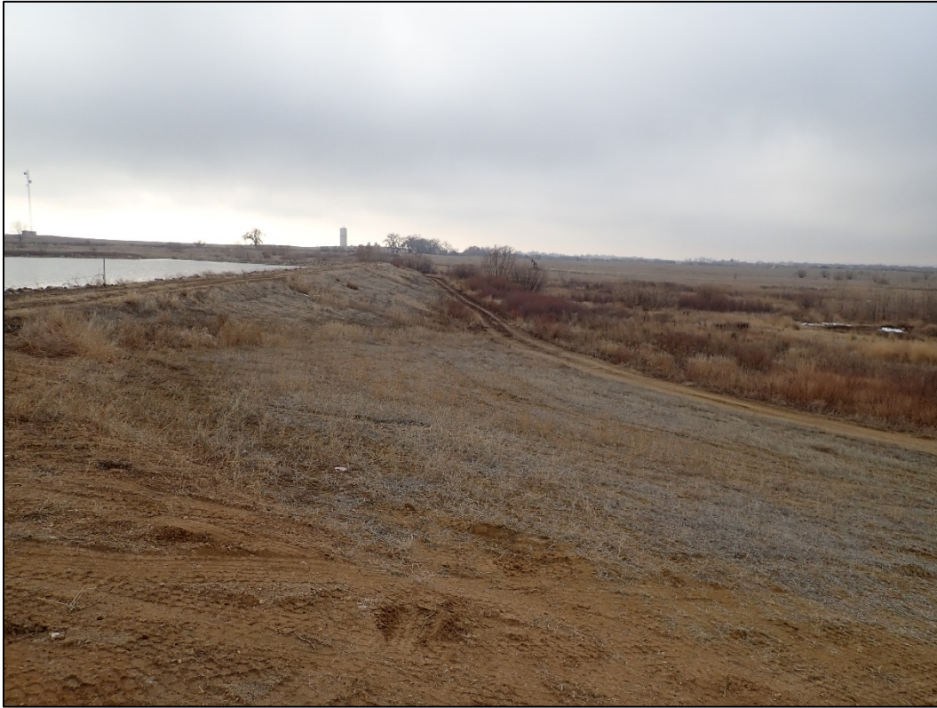
Photo 3. Signal Reservoir No. 2 embankment (left) and Signal Reservoir No. 1 (right); looking southwest.

Don Summers Todd Creek Village Metropolitan District 10450 E. 159th Court Brighton, CO 80602