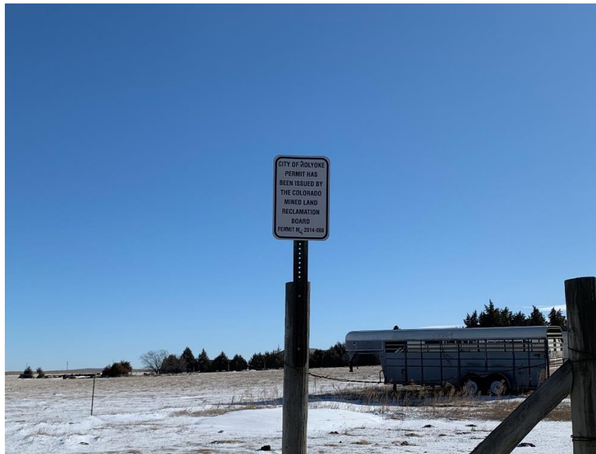
Mine entrance sign from County Road 45