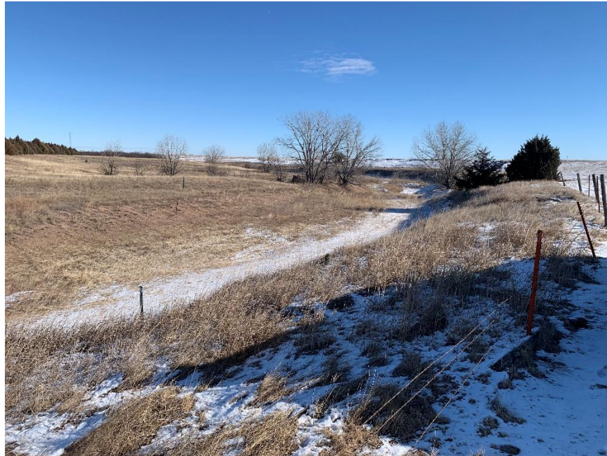
West side of permit area, Frenchman Creek looking east