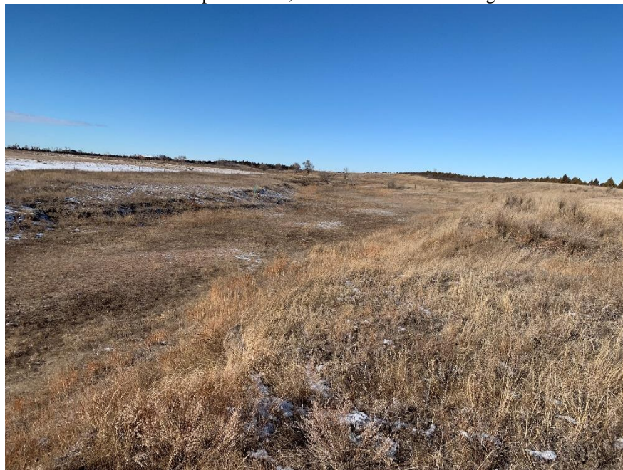
East side of permit area, Frenchman Creek looking north

Mark Brown City of Holyoke 407 East Denver Street Holyoke, CO 80734