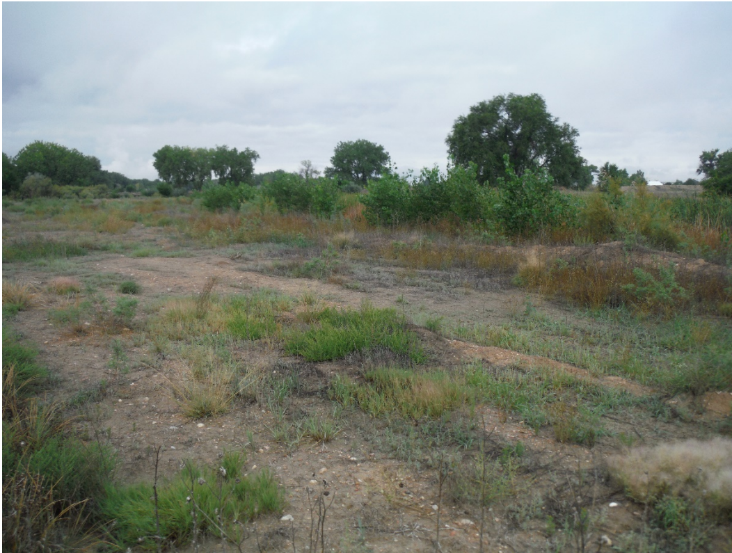
Photo 3. Backfilled area south of the remaining pond; looking northwest.

Ronda Neumeister RBK Construction, Inc. P.O. Box 387 Rye, CO 81069