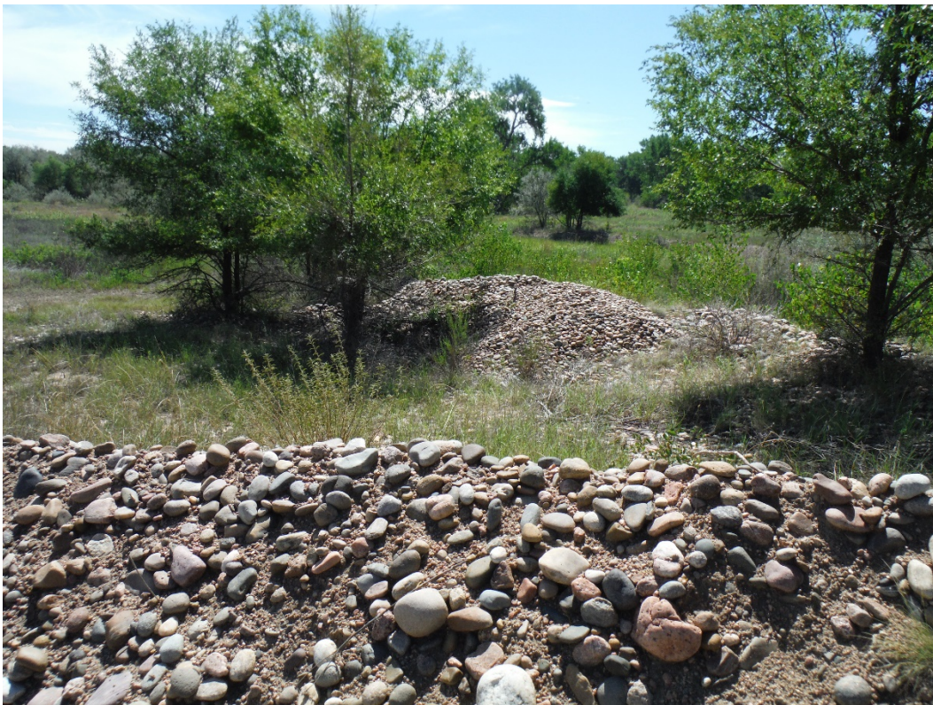
Photo 4. Small stockpiles of rock in the southwest corner of the permit; looking south.