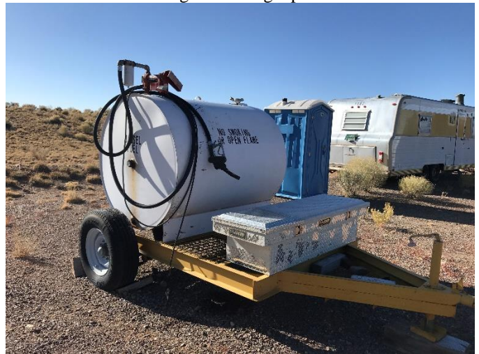
Fuel- with liner underneath