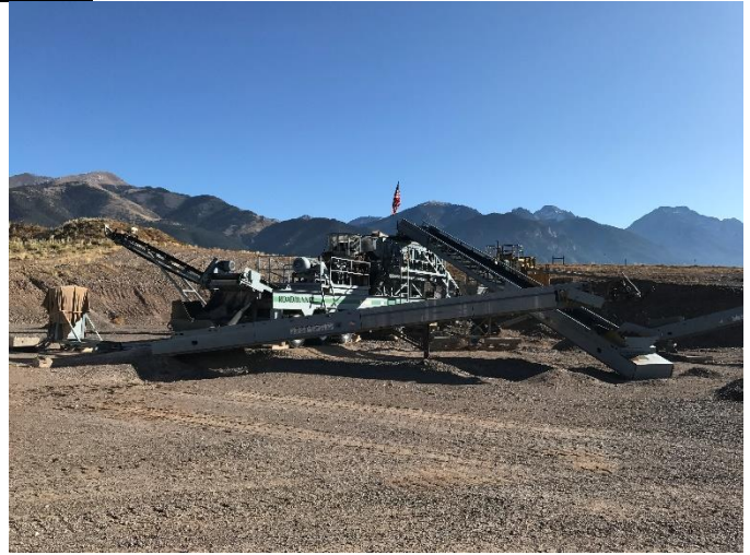
Crushing/ Screening Operations