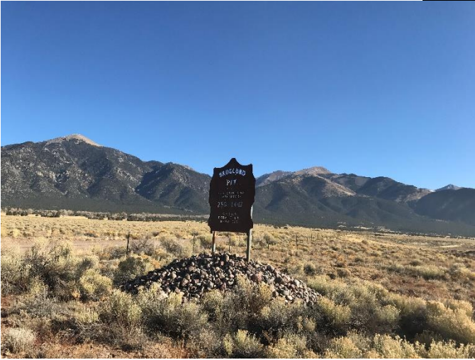
Mine ID sign