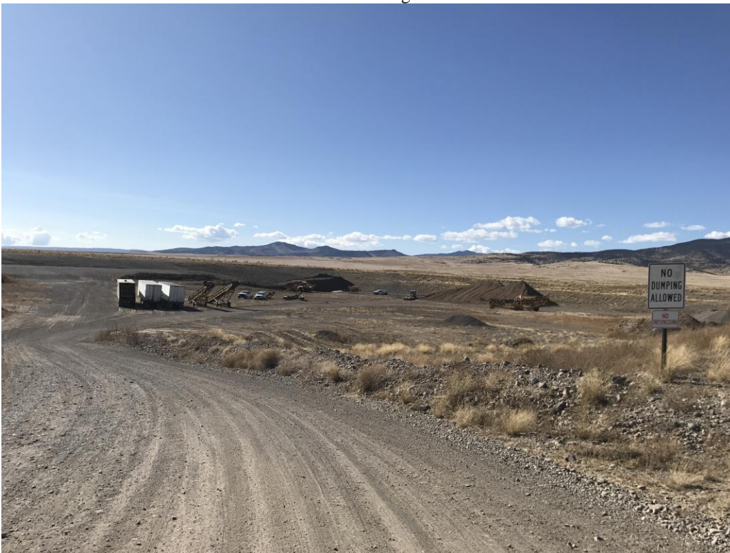
Southway Crushing Operations