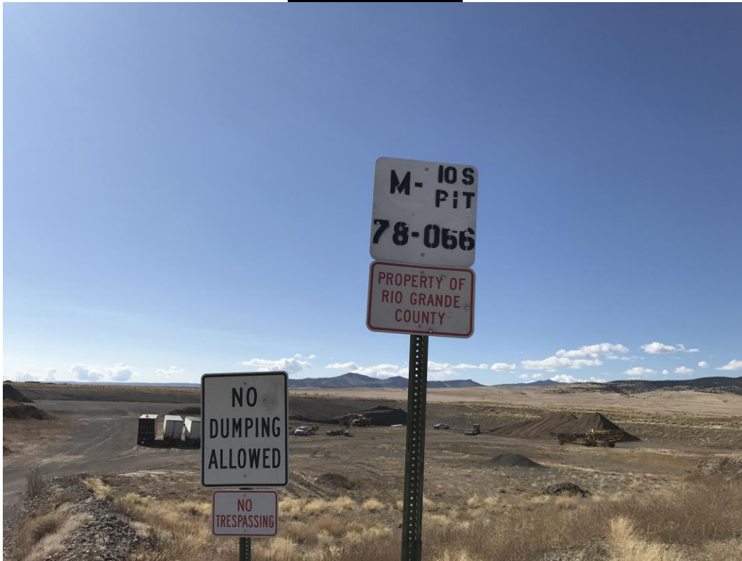
Mine ID Sign