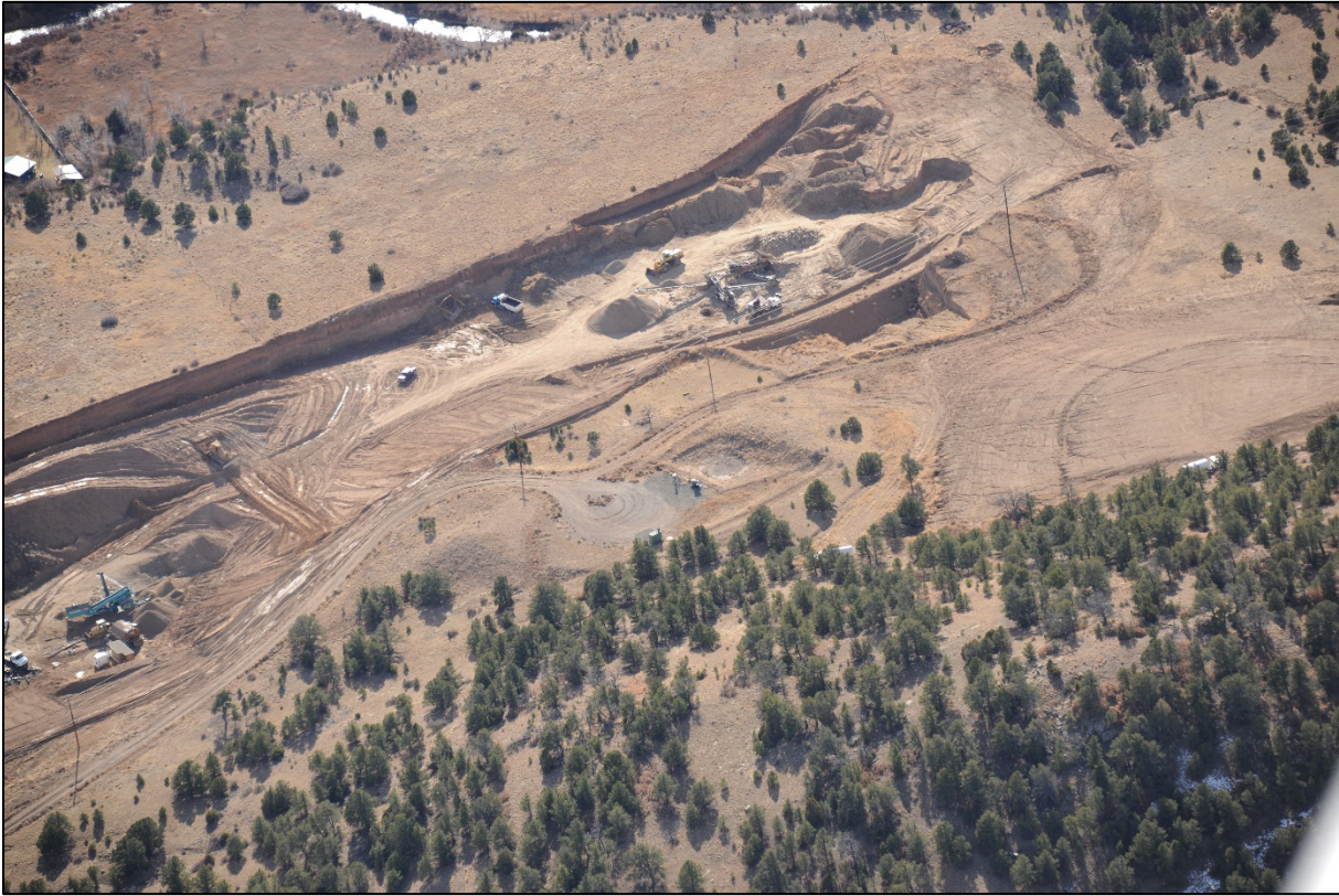
Photo 3: Rectangular pit with highwall along southern boundary needing to be backfilled