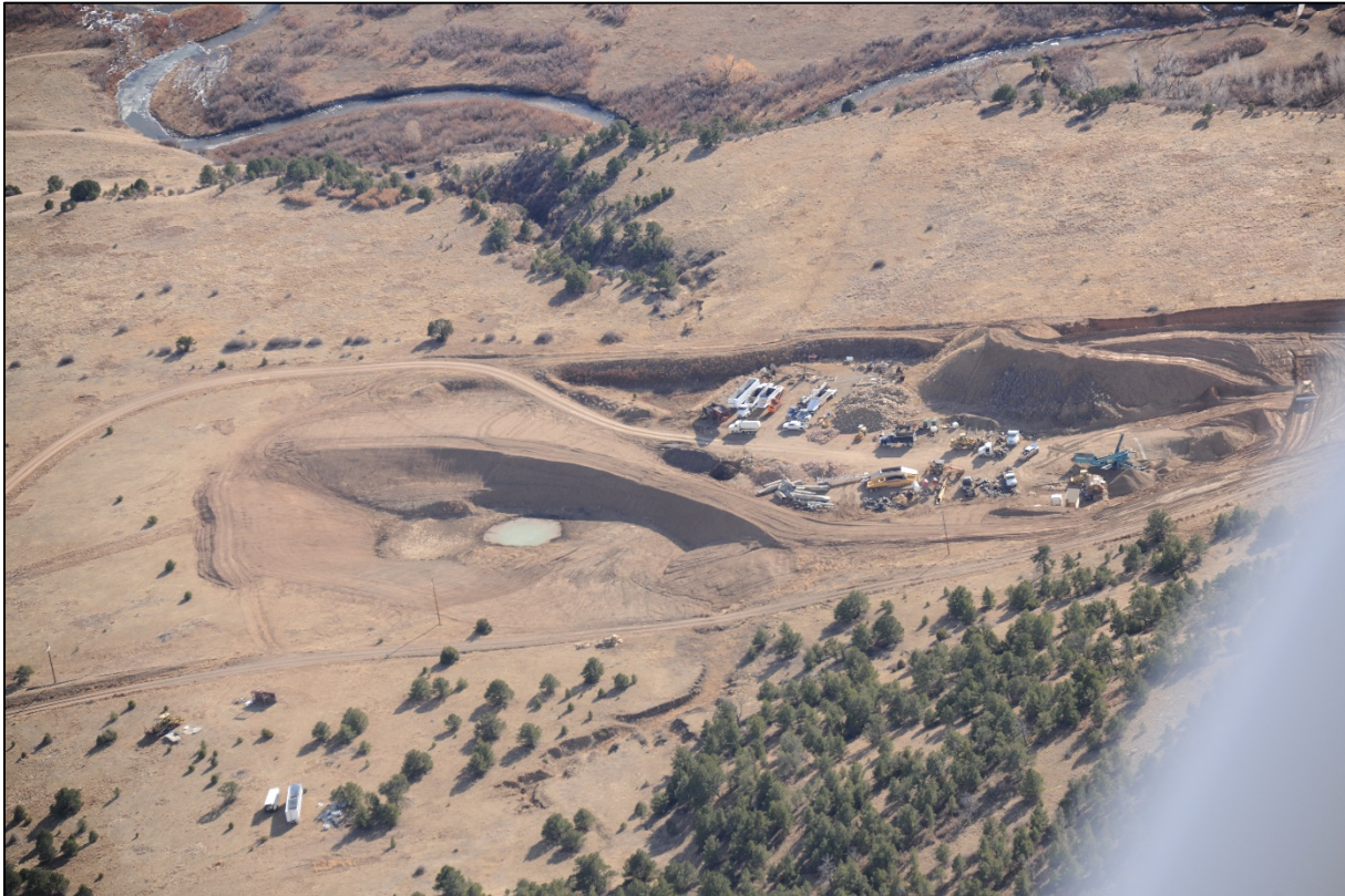
Photo 1: East end of the rectangular pit, basin needs to have the natural drainage reestablished