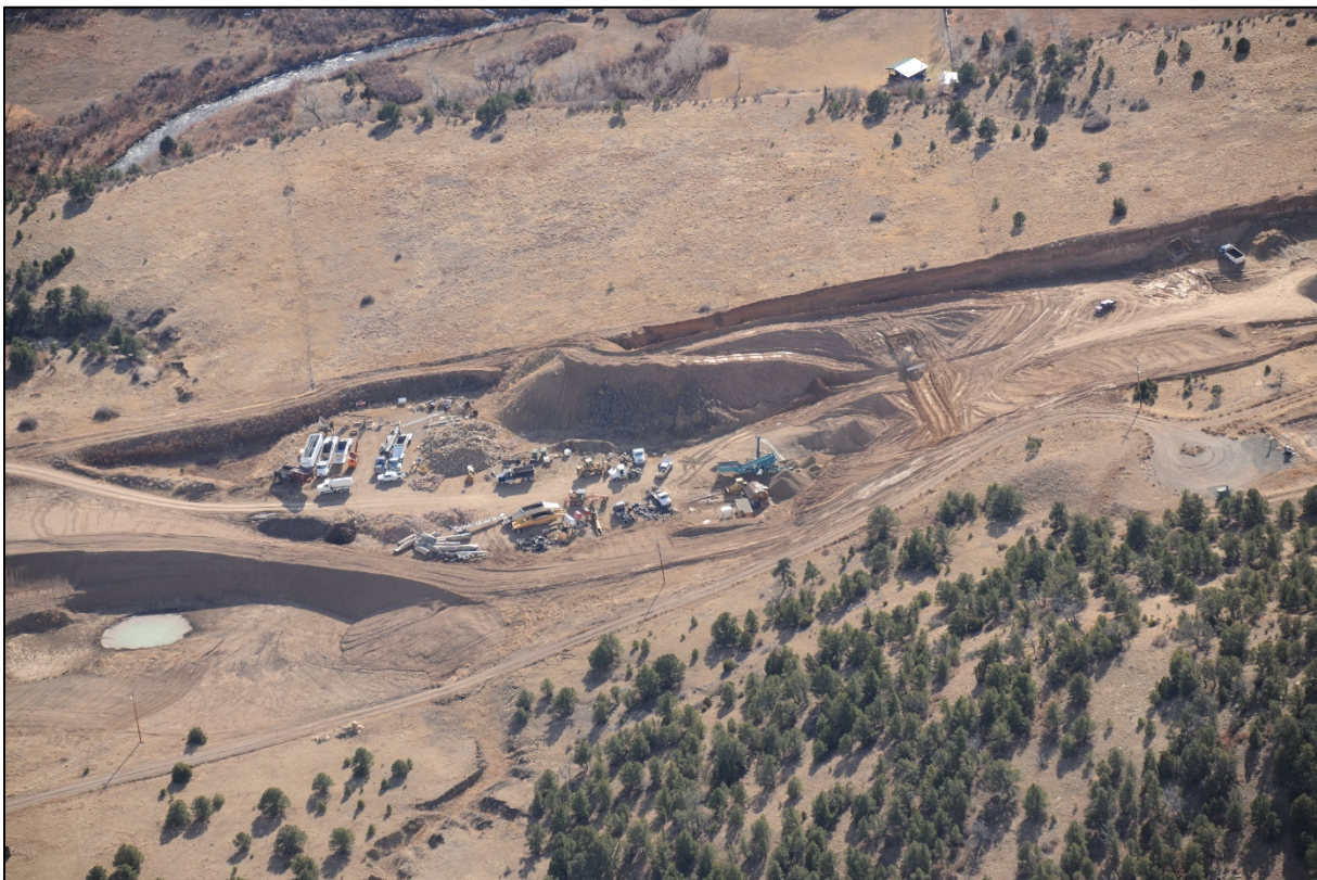
Photo 2: Rectangular pit with overburden stockpile being graded out