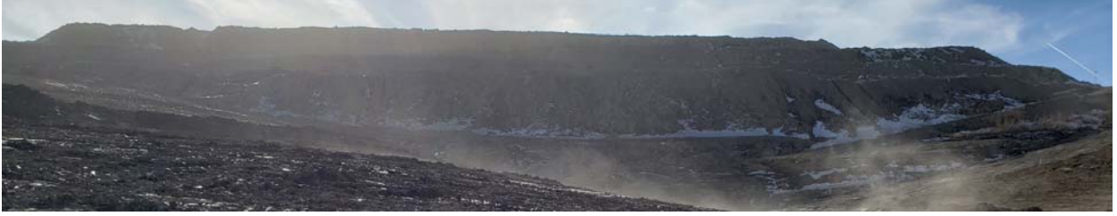
11-19-19 - East Taylor Fill looking south from the West Pit reclaimed area