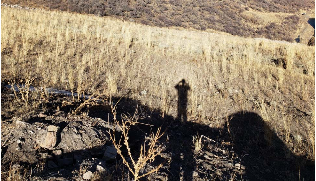
11-19-19 - West Taylor fill looking northwest from monitoring well location