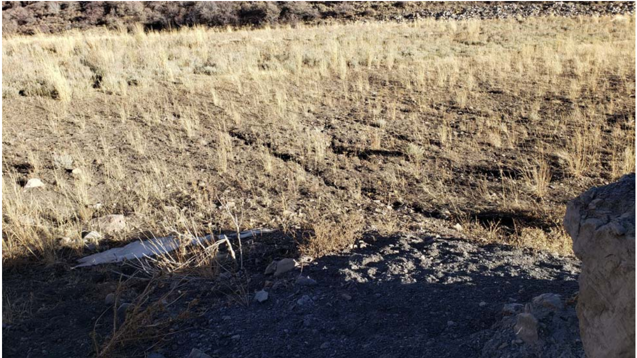
11-19-19 - West Taylor fill looking northeast from monitoring well location