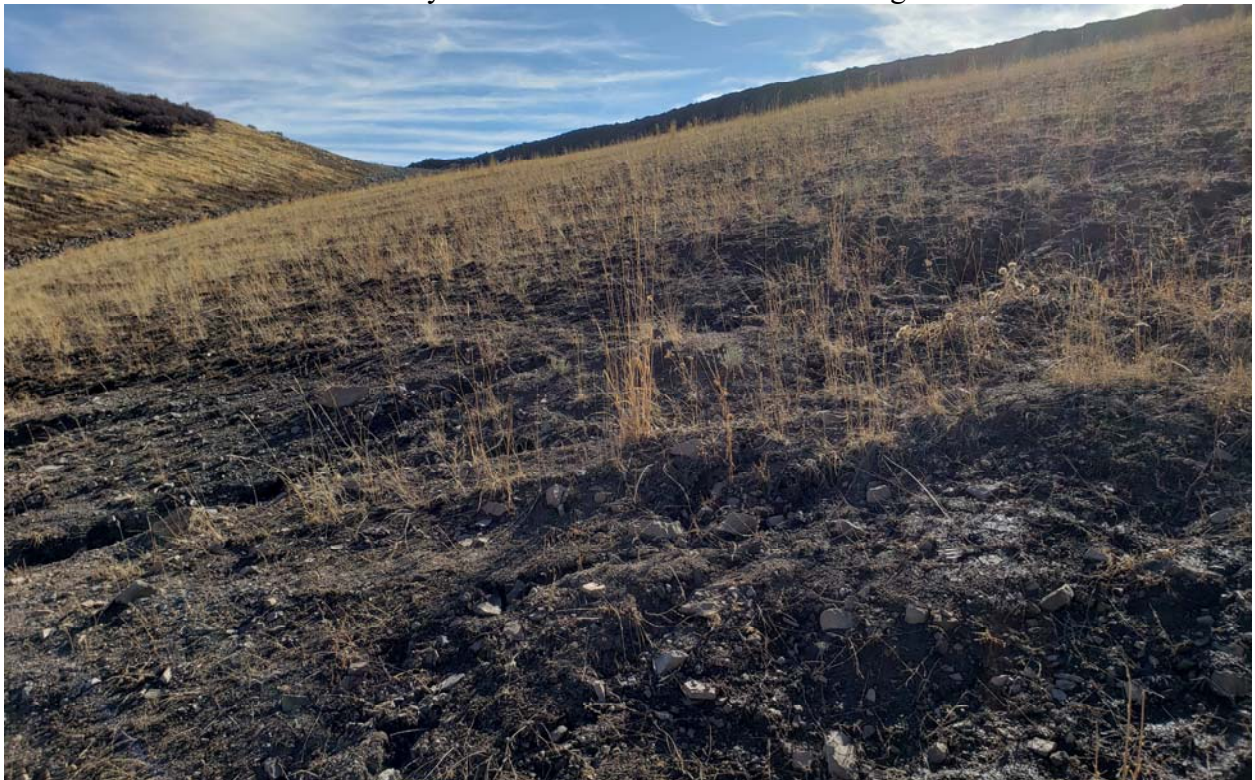
11-19-19 - West Taylor Fill East Flank from monitoring well location