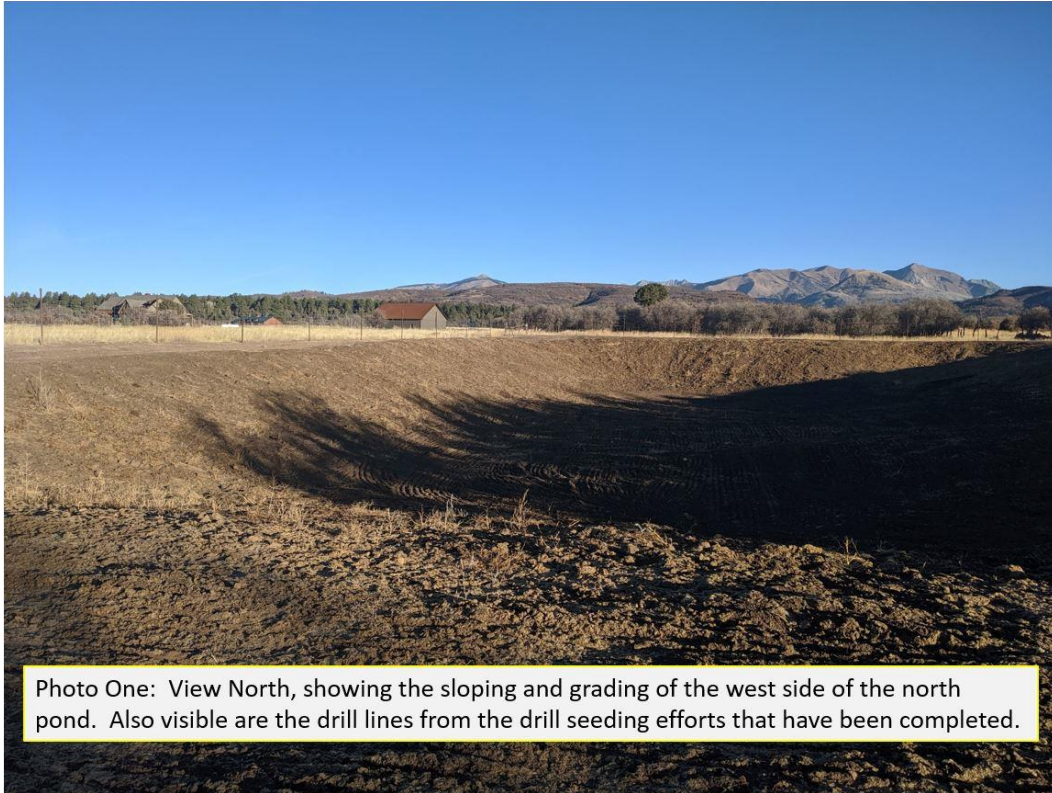
Photo One: View North, showing the sloping and grading of the west side of the north pond. Also visible are the drill lines from the drill seeding efforts that have been completed.