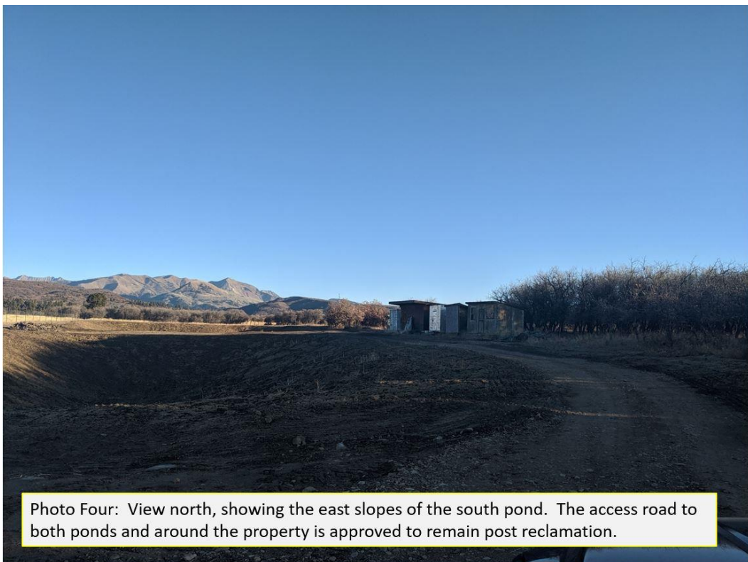
Photo Four: View north, showing the east slopes of the south pond. The access road to both ponds and around the property is approved to remain post reclamation.