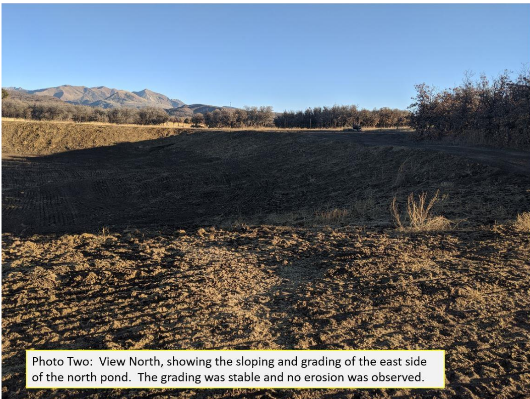
Photo Two: View North, showing the sloping and grading of the east side of the north pond. The grading was stable and no erosion was observed.