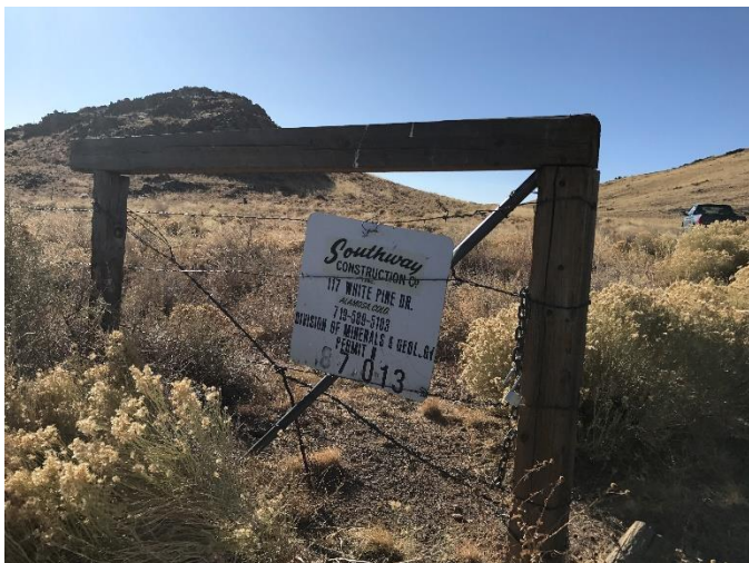
Mine ID Sign