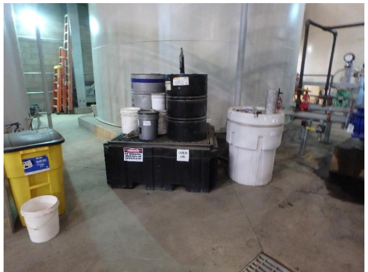
Property Discharge Water Treatment Plant