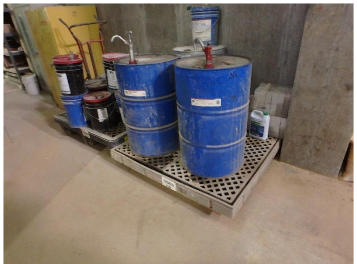
Sludge Densification Plant