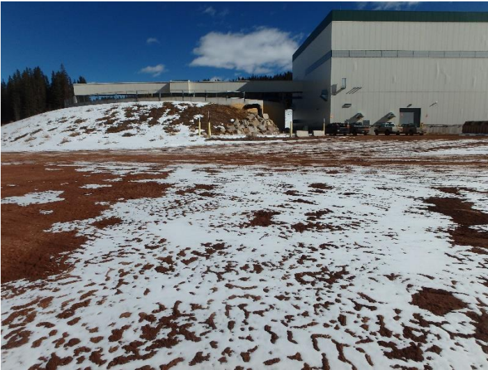
Sludge Densification Plant