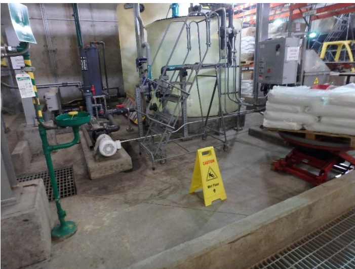
Property Discharge Water Treatment Plant