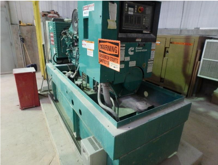
Sludge Densification Plant