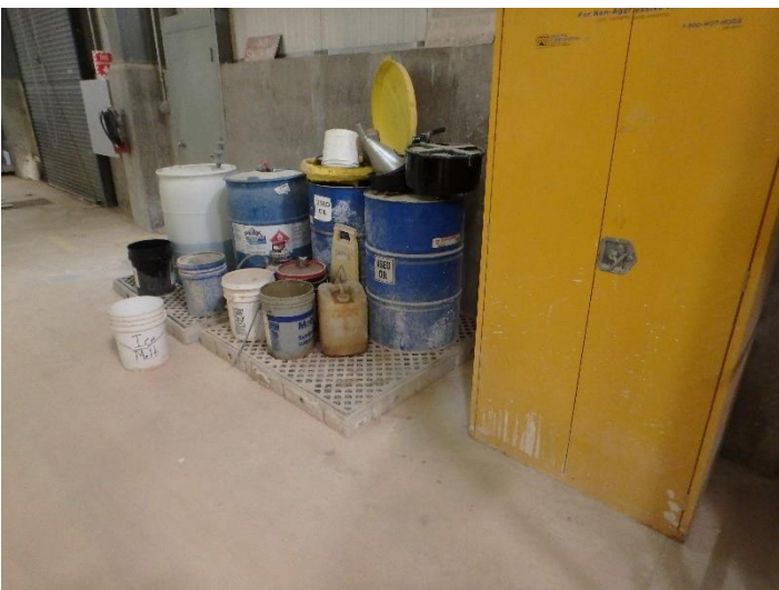
Sludge Densification Plant