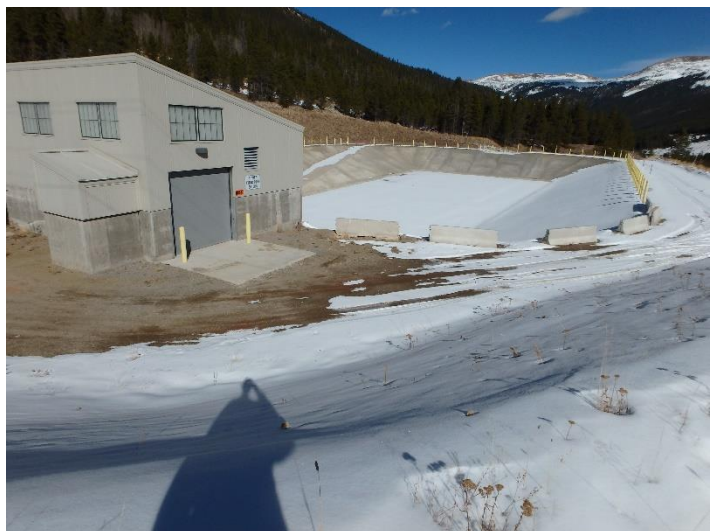
PDWTP Events Pond