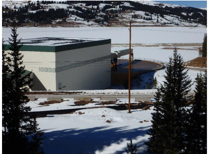
Sludge Densification Plant