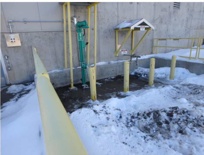
PDWTP Acid Load Out