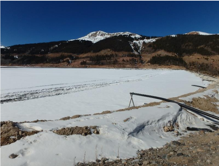
Mayflower TSF-5 Dam