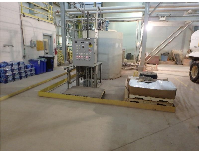
Sludge Densification Plant