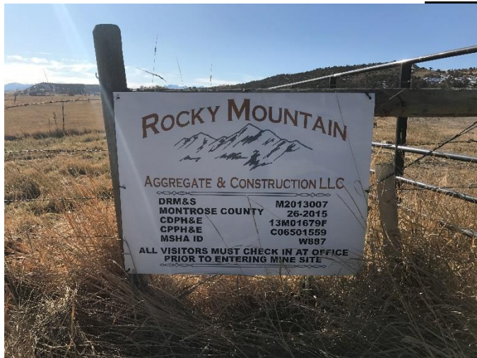
Mine ID Sign