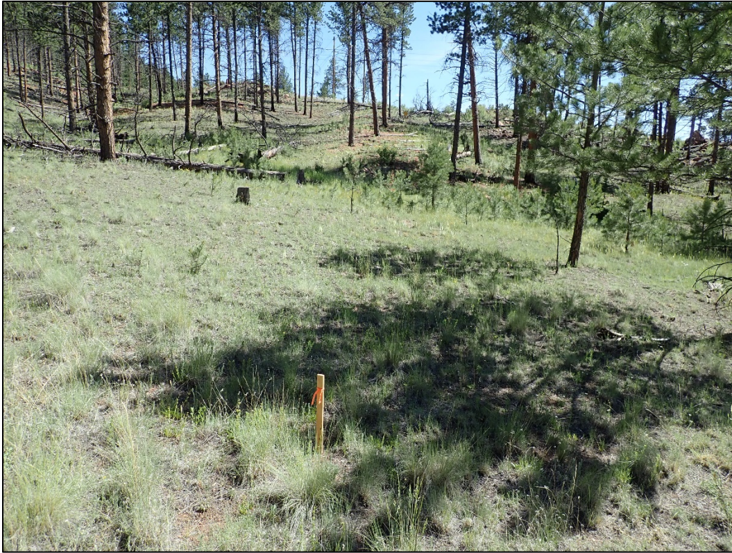
Photo 3. Northern permit boundary corner of Site #2; looking southeast.

John Crowley 382 McArthur Dr. Lone Tree, CO 80124