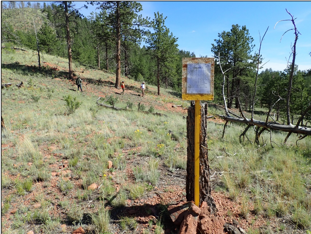
Photo 1. On-site notice in Site #1, posted in accordance with Rule 1.6.2(1)(b); looking southeast.