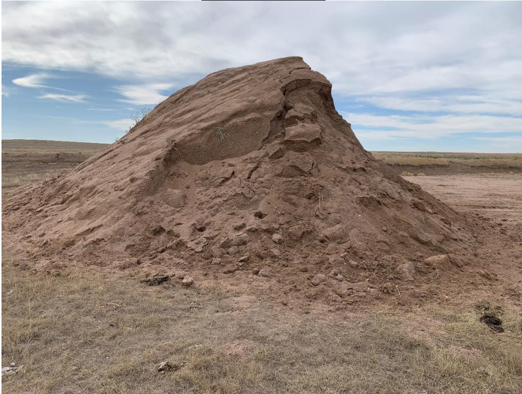
Gravel stockpile on north side of creek bed