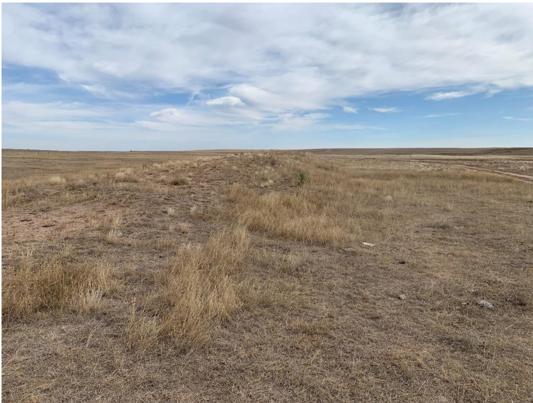
Topsoil stock pile located north of mine workings area.