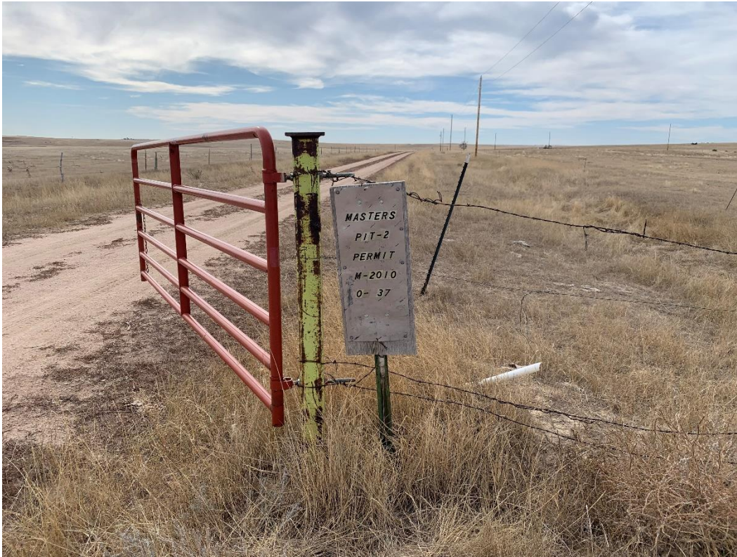
Mine entrance sign

Elva Masters 25901 US Highway 36 Anton, CO 80801