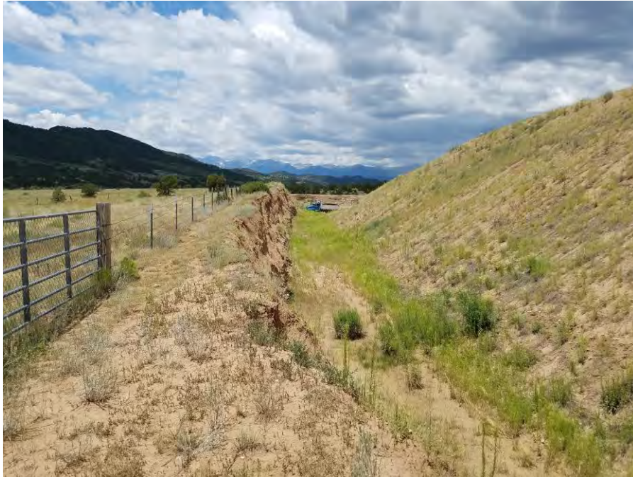
Figure 1. From the south central portion of the permit boundary looking west.