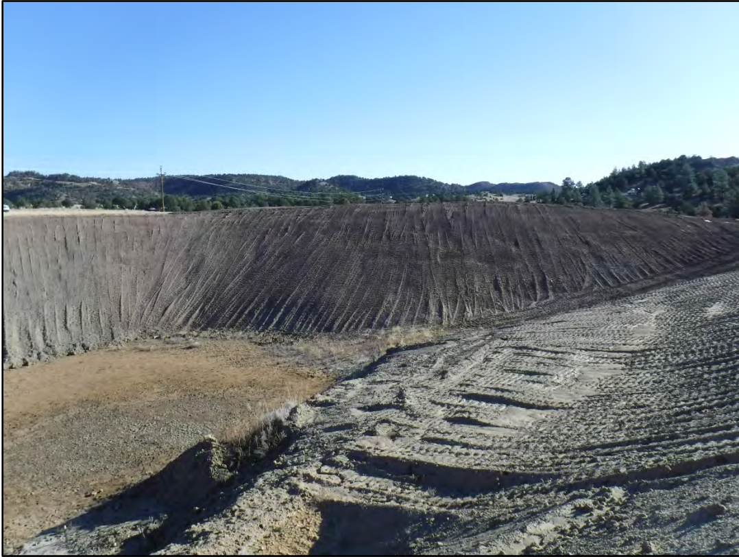
Photo 5: Outlet of basin in Area 1 still needs appropriate outlet unless otherwise allowed to detain water