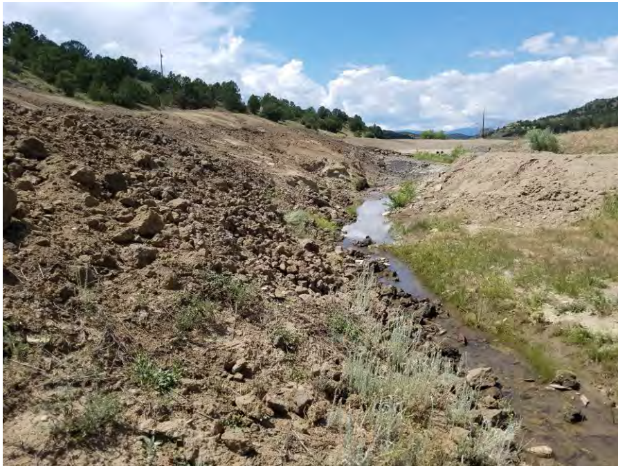
Figure 10. Re-established stream channel on the south side of the Reclamation Area only parcel looking north.