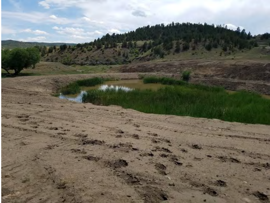
Figure 11. Pit basin on the south side of the access road from the east side looking west.