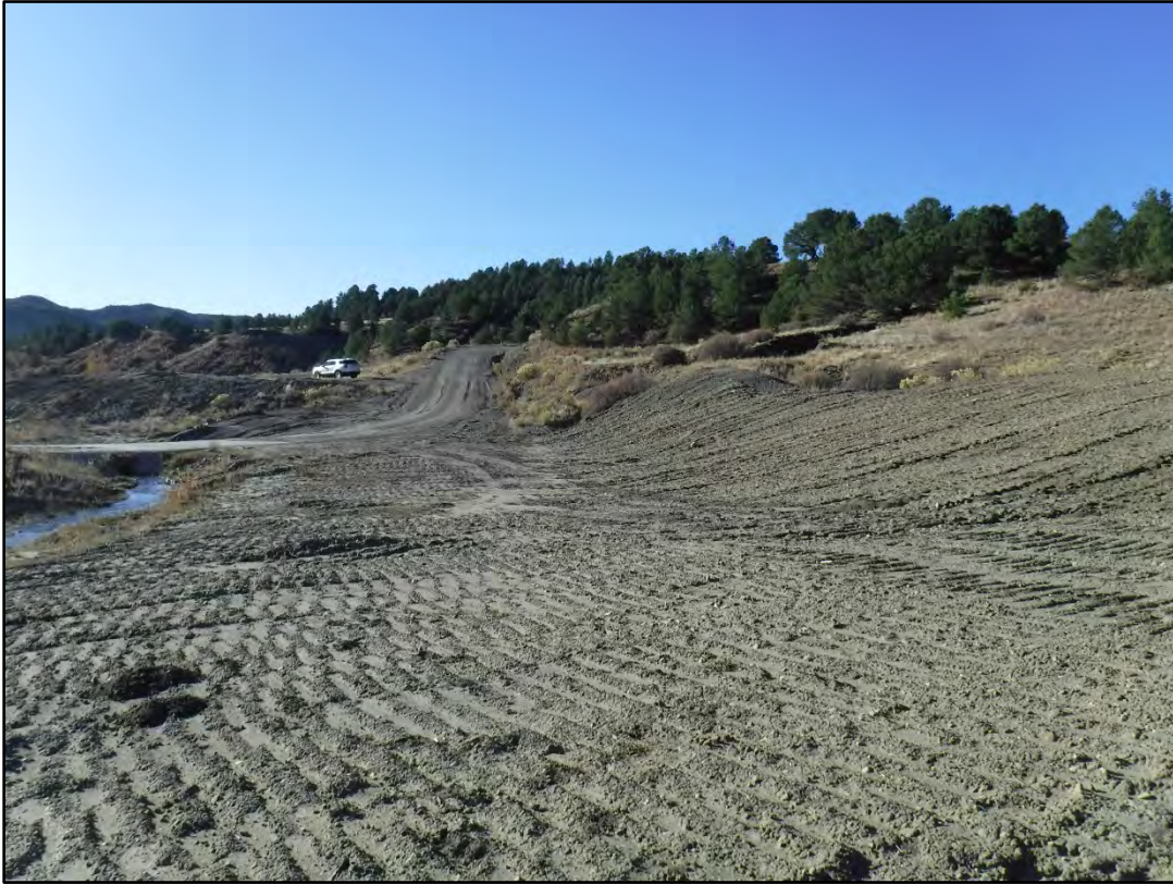
Photo 3: Area near entrance to mine regraded but still needed seeding