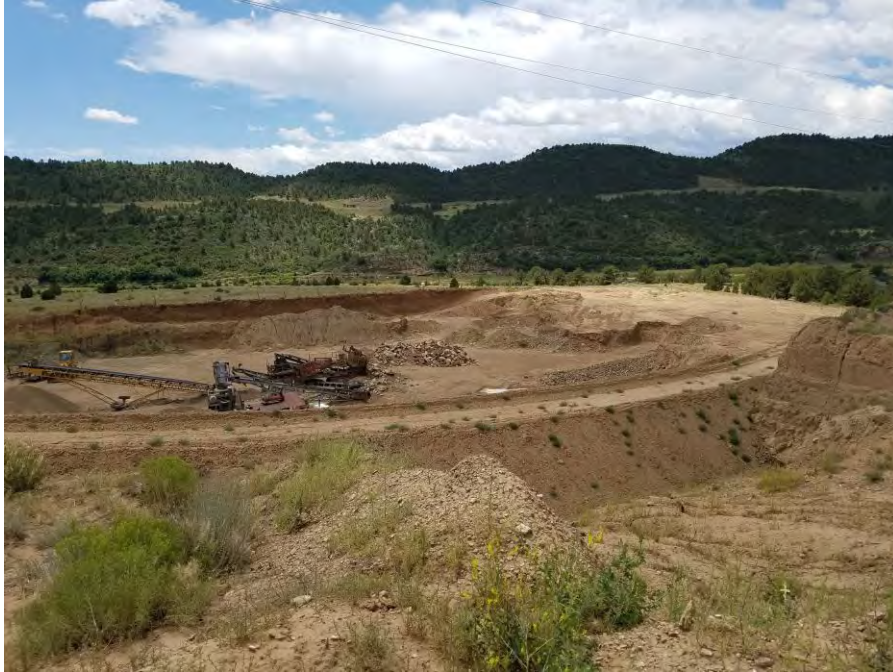
Figure 5. From the north side of the southwest portion of Area 1 looking south.