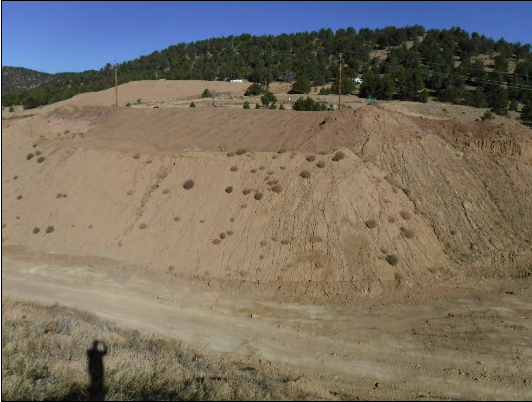
Photo 11: Looking north at the northern highwall along Area 1 that needs continued regrading