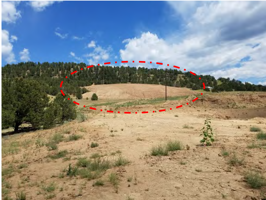
Figure 3. From the southwest corner of the Area 1 affected land looking north. The overburden storage area outlined in red.