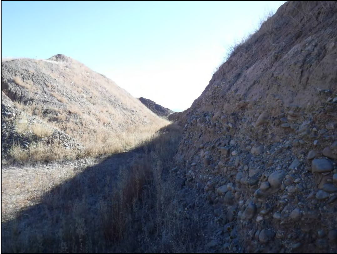
Photo 9: Looking east at the area between the highwall and the overburden stockpile