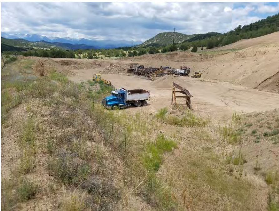
Figure 2. From the south western end of the south boundary looking west by northwest into Area 1 pit.