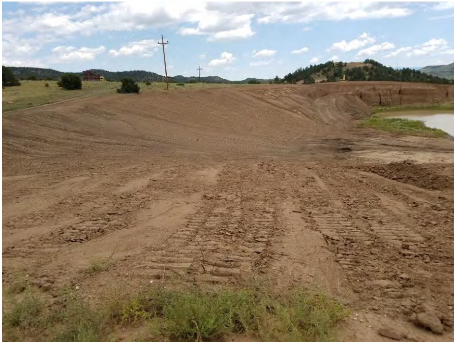
Figure 6. From the north central portion of Area 1 looking southeast at the graded portion of Area 1.