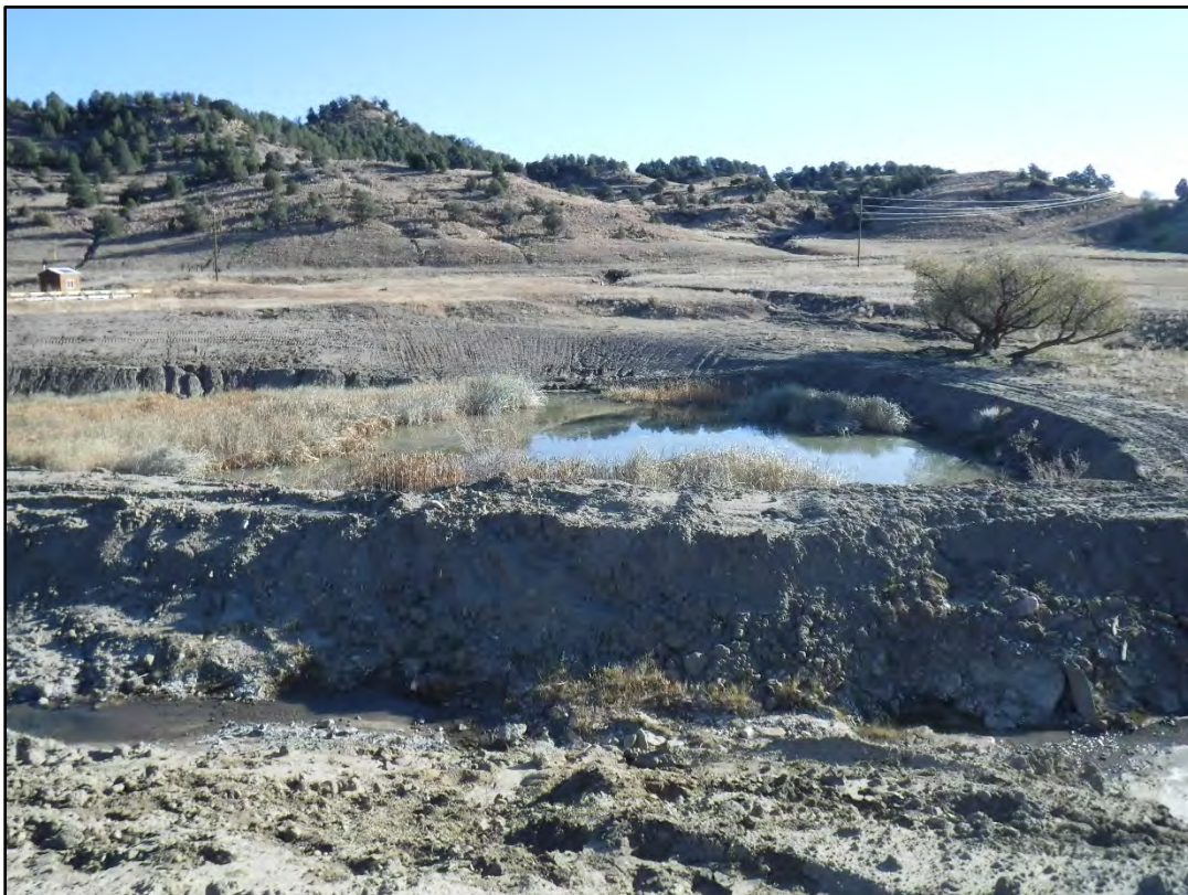
Photo 2: One of the two ponds needing augmentation, this one is at the entrance to mine site