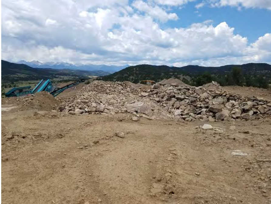
Figure 7. Top area of Area 2.