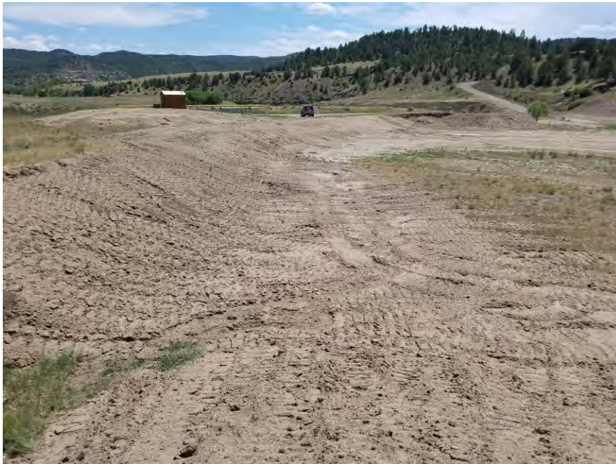
Figure 8. Reclamation Area Only parcel. North of the access road looking south from the east end.