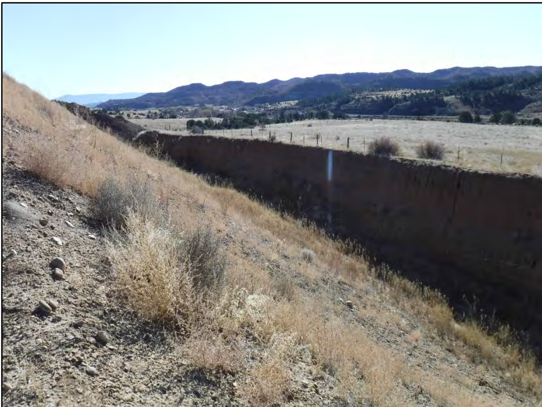
Photo 10: Looking south from the stockpile to the highwall that needs to re-graded to 3H:1V slope