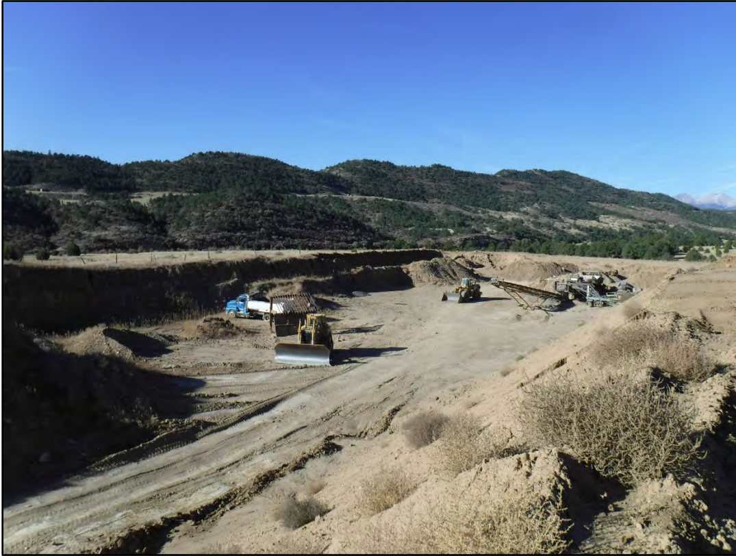
Photo 7: Near vertical highwall immediately west of overburden stockpile