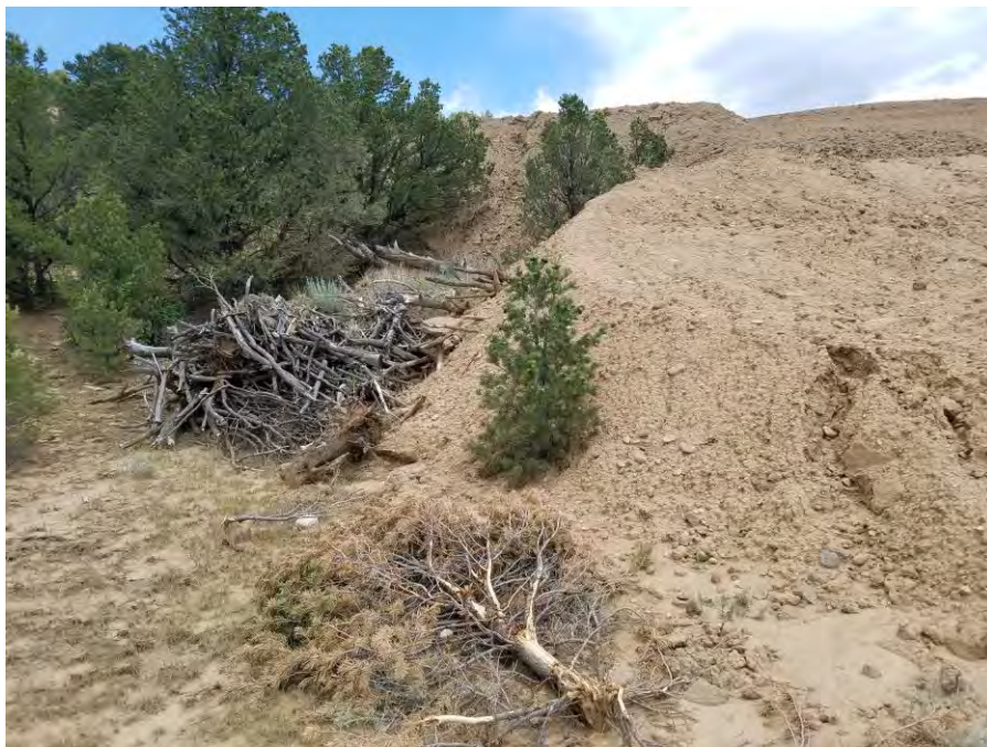
Figure 4. From the southwest end of the former overburden storage area looking north. Steep slope area that will need to be graded.