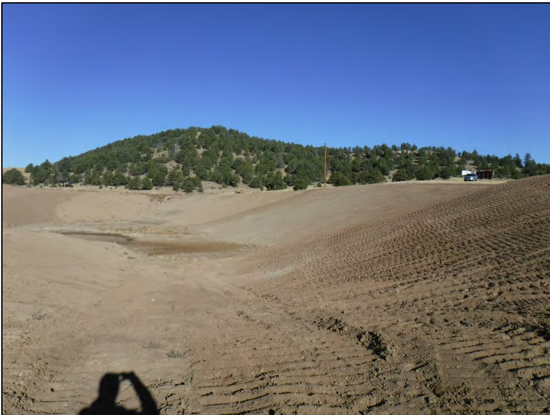
Photo 4: Basin in the eastern portion of Area 1, regraded slopes still require seeding