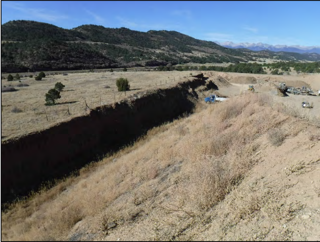
Photo 13: Looking west along the area between the highwall and stockpile