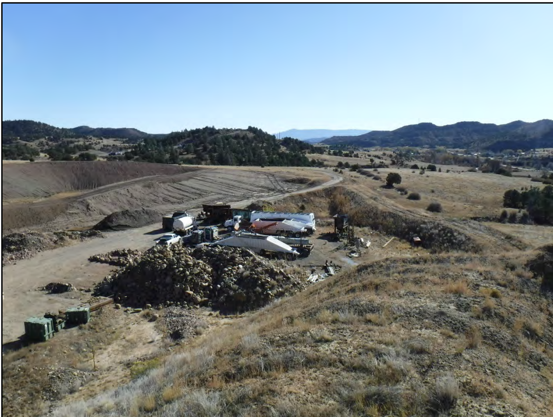
Photo 14: Looking east from the stockpile over the eastern portion of Area 1