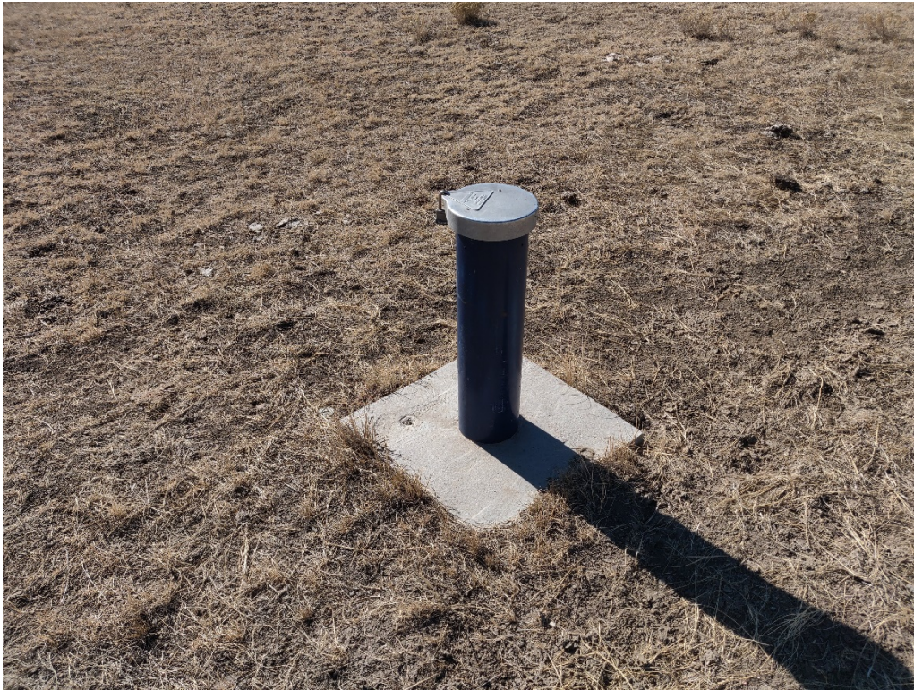
Typical groundwater monitoring well completion and surrounding vegetation