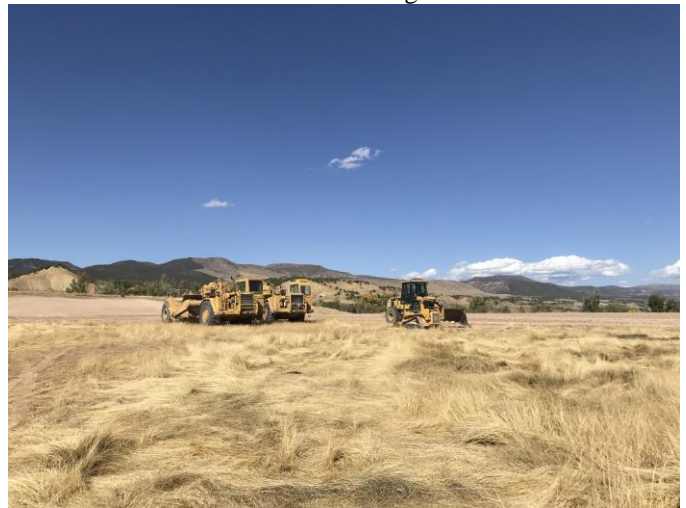
2 Graders and Loader on Site