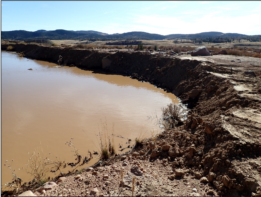
Photo 4. Raised embankment in northwest corner of northern process pond; looking southeast.