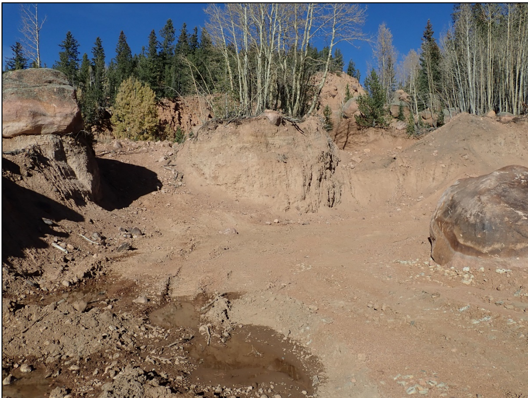
Photo 11. Northern highwall in the Northern Pit which operator is requesting to reclaim; looking northwest.