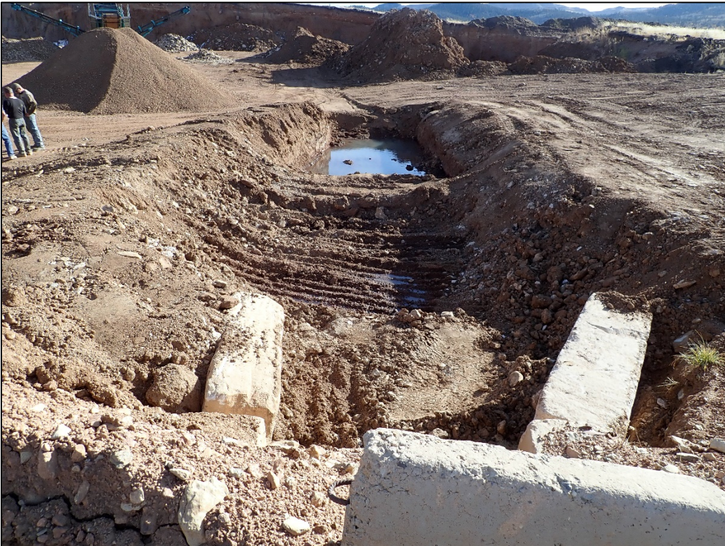
Photo 9. Storm water detention basins being constructed in the Southern Pit; looking south.