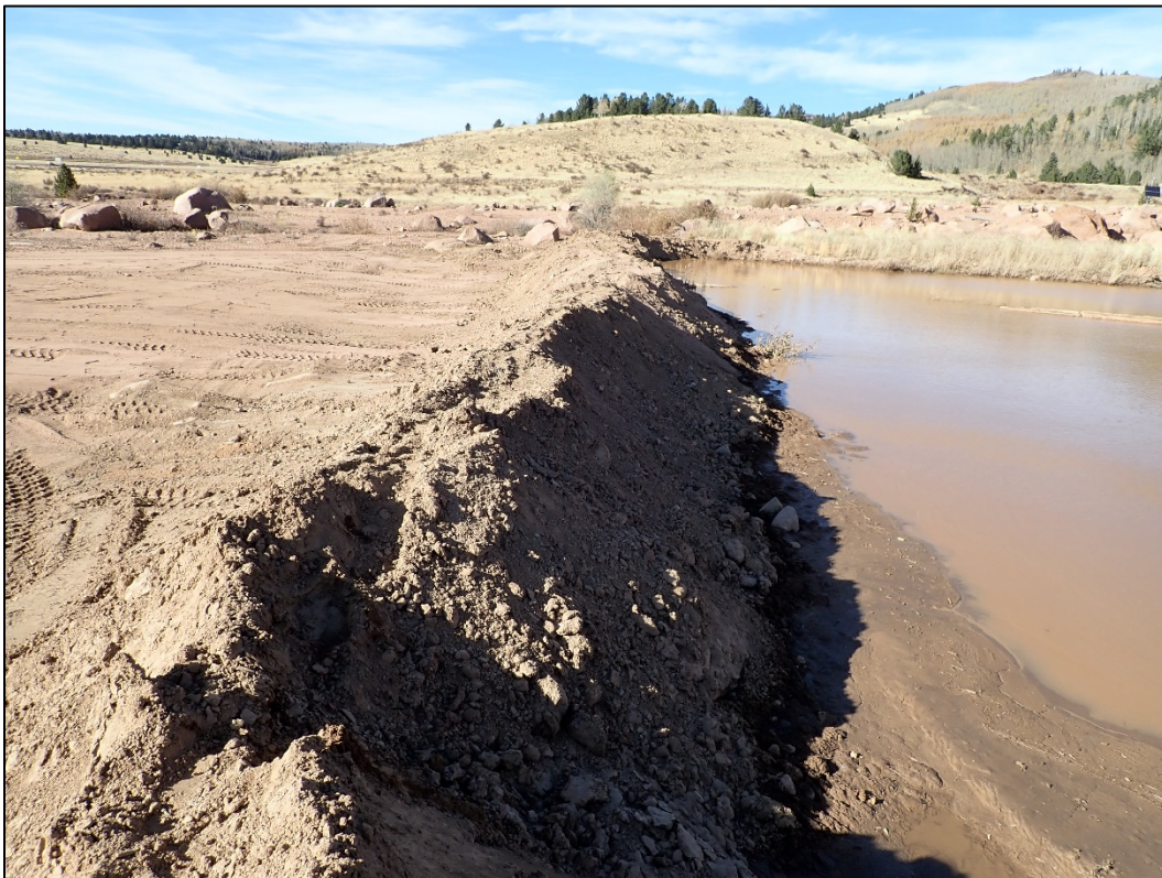
Photo 5. Raised embankment along western side of the northern process pond; looking north.