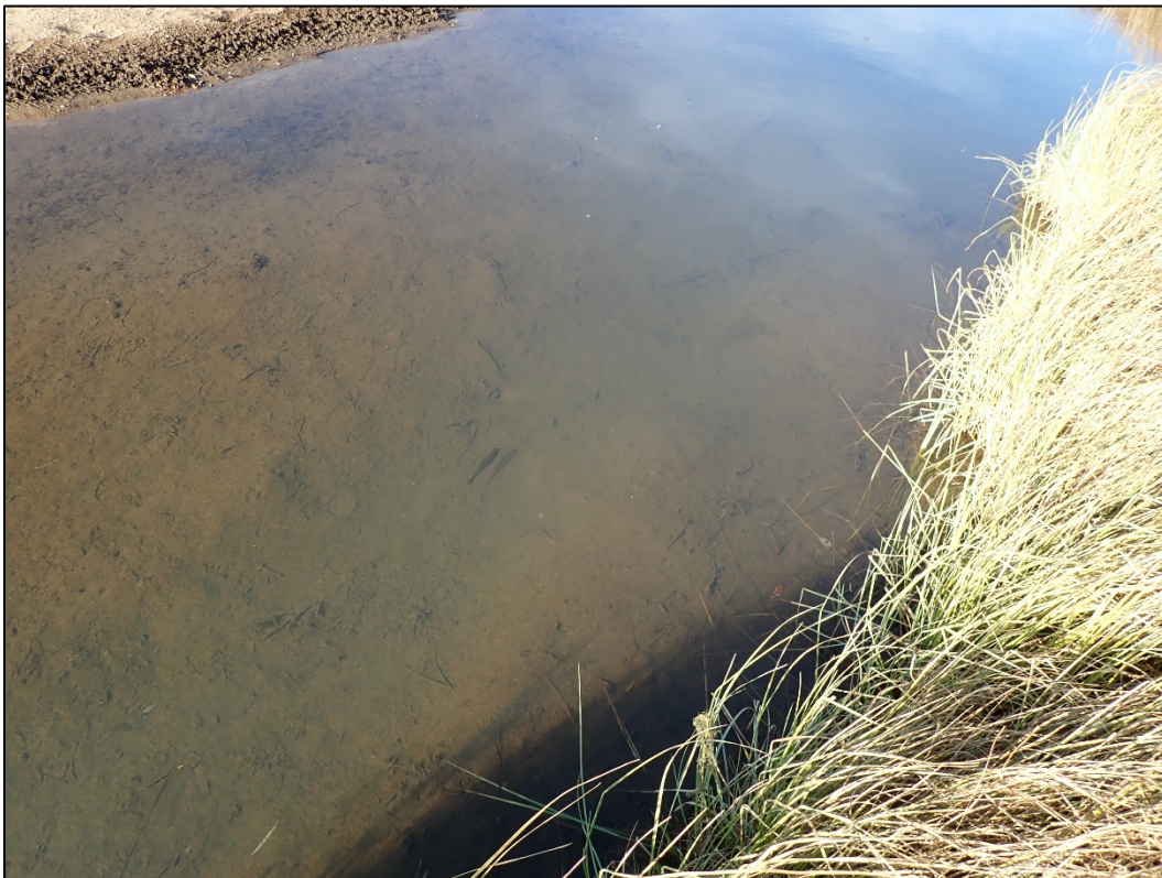
Photo 3. Brook trout and clear water in Beaver Creek downstream of site; looking northwest.