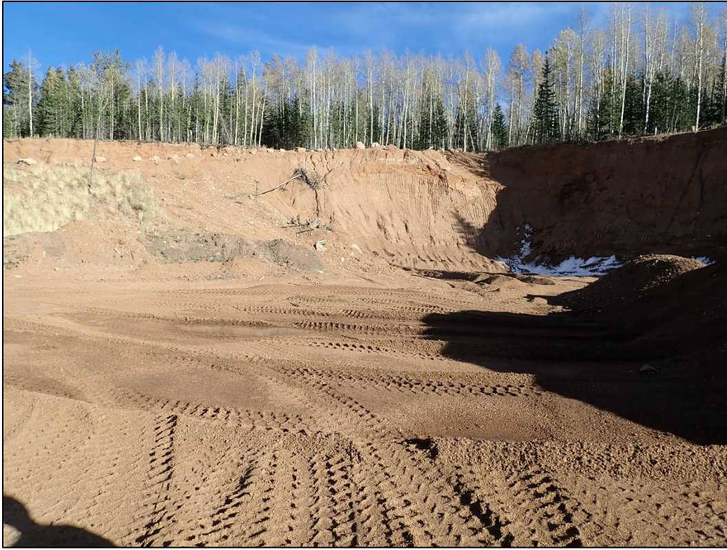
Photo 12. Eastern highwall in the Southern Pit which operator is requesting to reclaim; looking east.

Chris Pyles Gillette Sand and Gravel, Inc. 20575 Hwy 24 Woodland Park, CO 80863