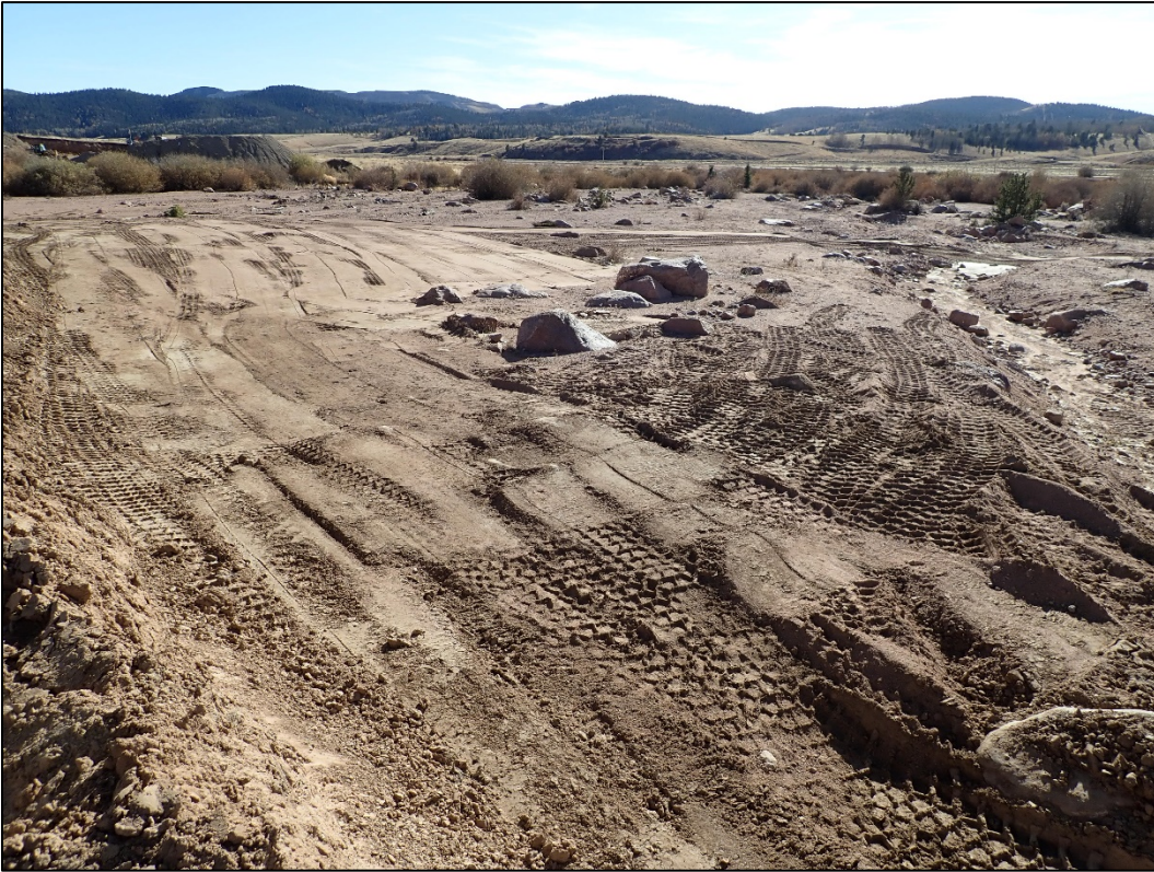
Photo 8. Graded off-site disturbance area to the west of the permit boundary; looking southwest.