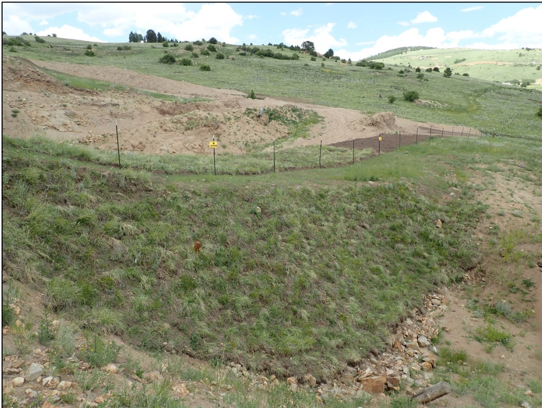
Photo 4. Reclaimed lands on the Burtis property, south of the mining area (background); looking northeast.