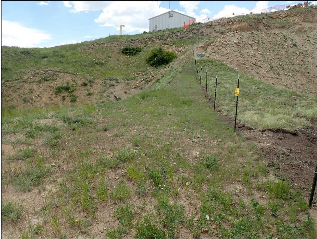
Photo 1. Reclaimed lands on the Burtis property, south of the mining area (right); looking west.