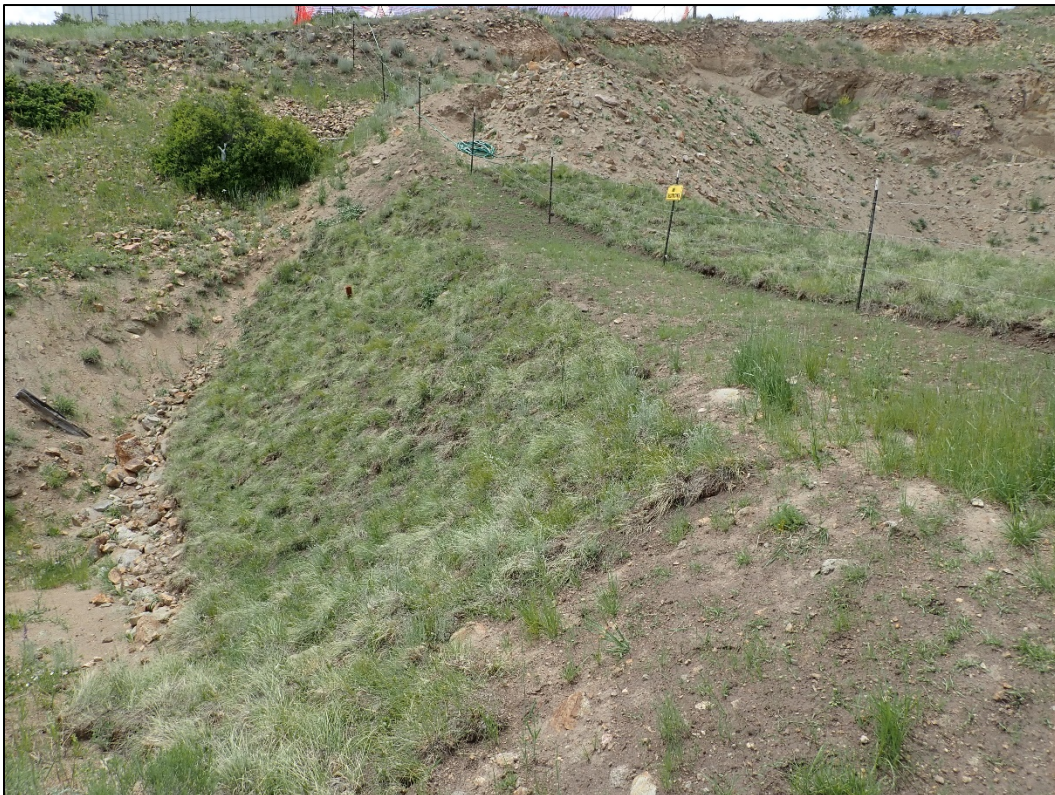
Photo 2. Reclaimed lands on the Burtis property, south of the mining area (background); looking northwest.