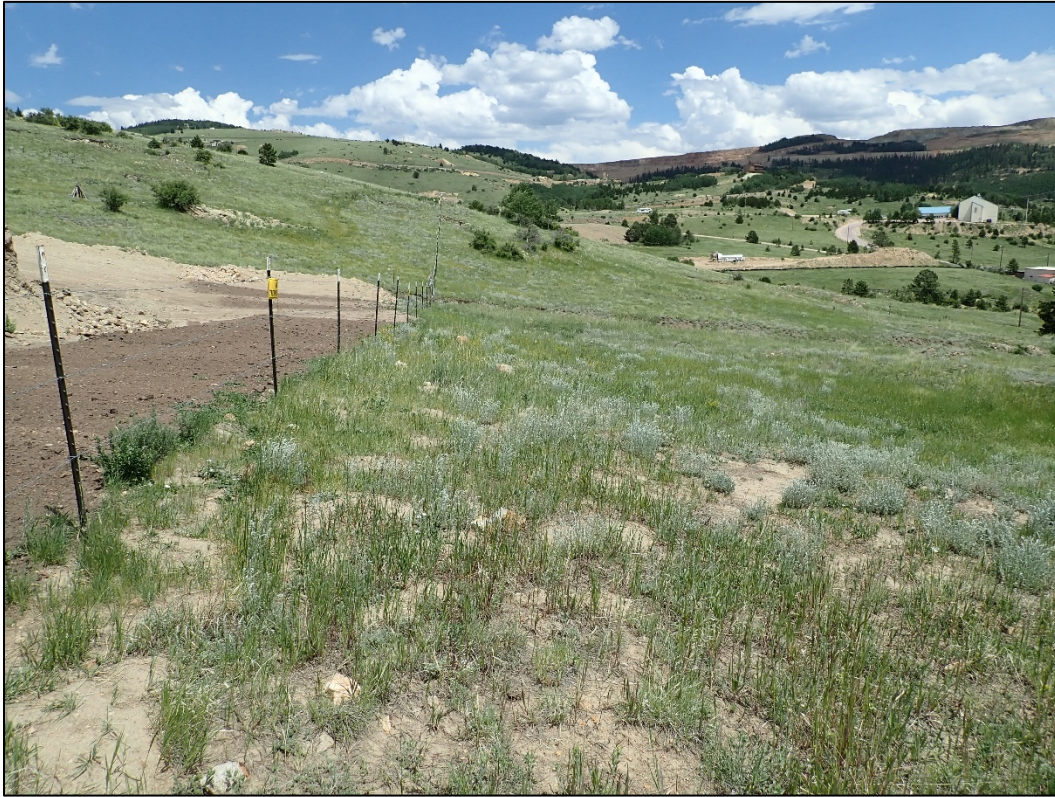
Photo 5. Sample photo of undisturbed off-site lands on the Burtis property, located east of the reclaimed disturbance; looking east.

Harriet Graham Bad Boys of Cripple Creek Mining Co., Inc. 1429 Locust Drive Canon City, CO 81212