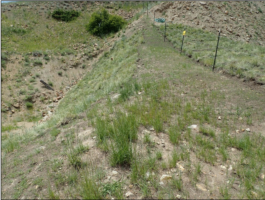
Photo 3. Reclaimed lands on the Burtis property, south of the mining area (right); looking west.