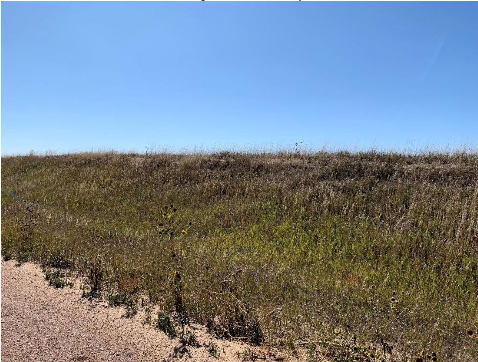
Topsoil stockpile well vegetated.