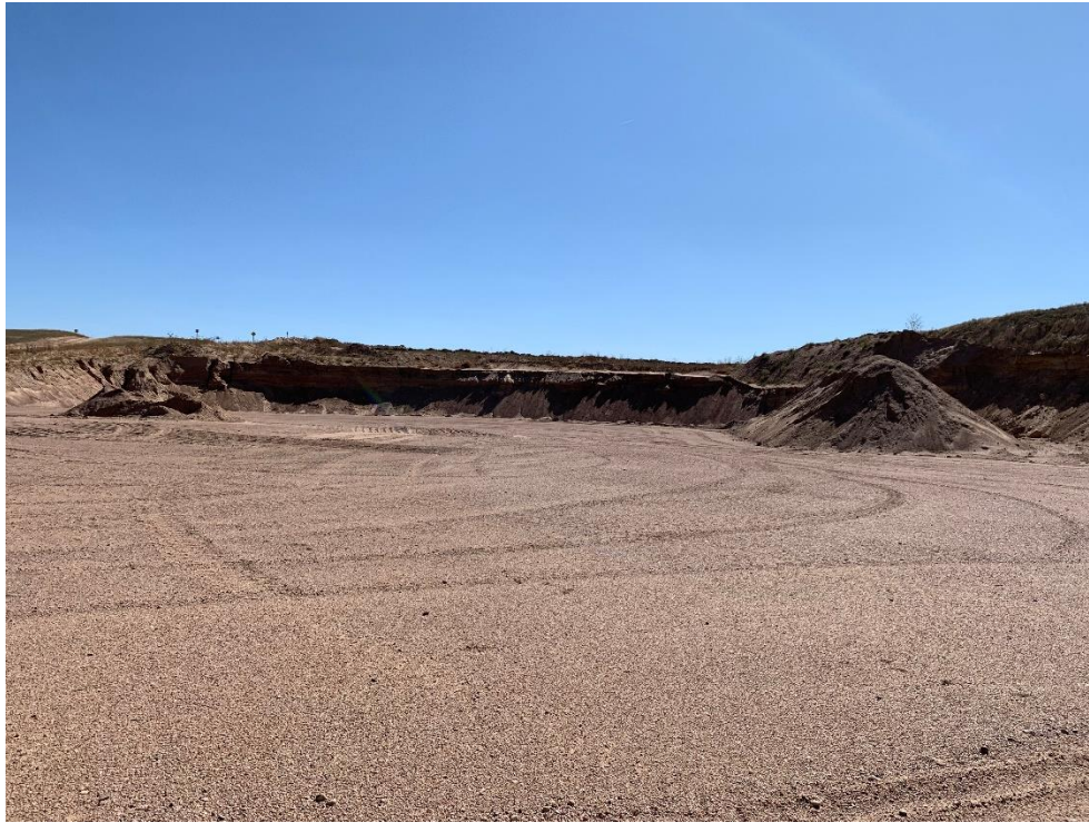
Bottom of pit area with highwall and stockpiled material.