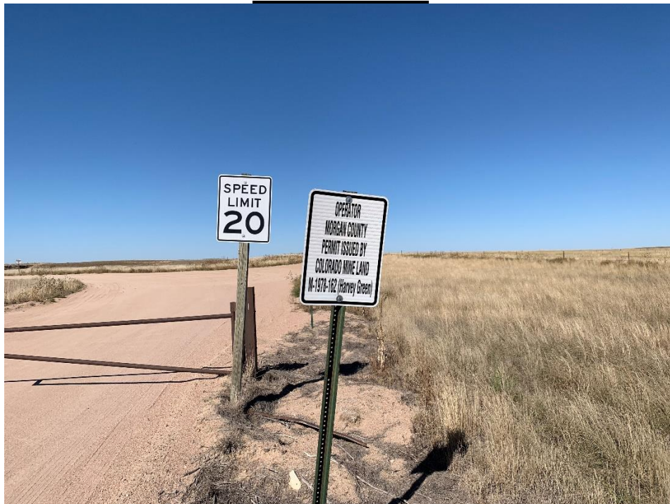
Mine entrance sign facing County Road GG