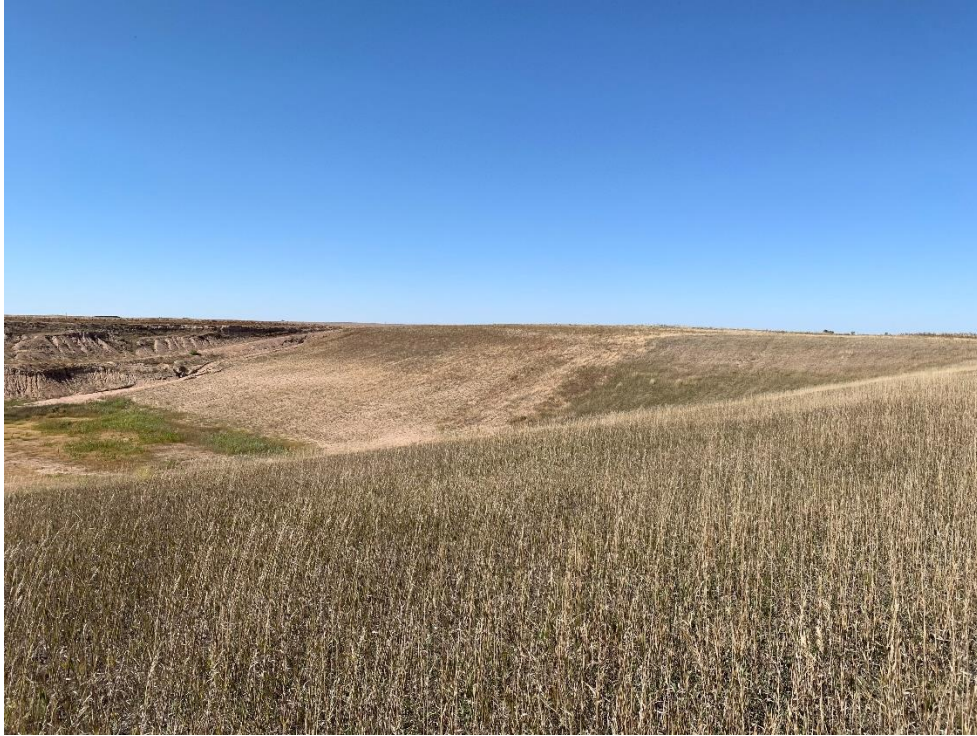
Northern slope that was recently seeded.