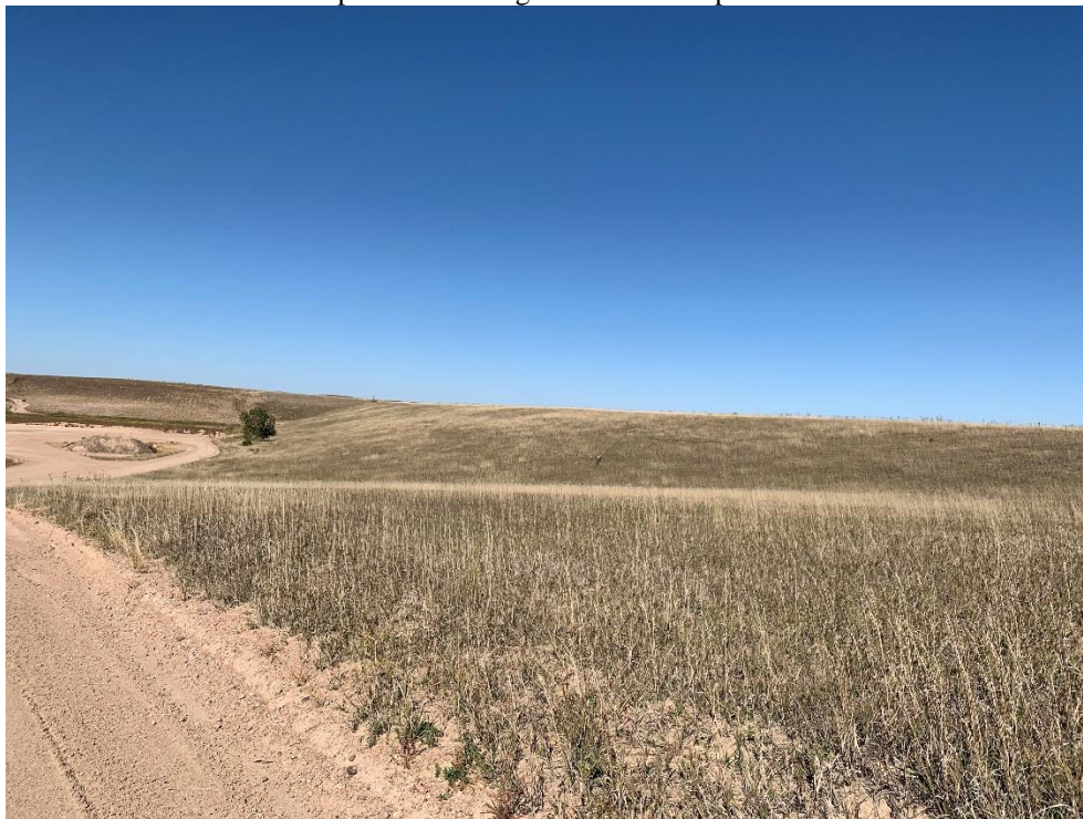
Eastern slope of pit established vegetation.