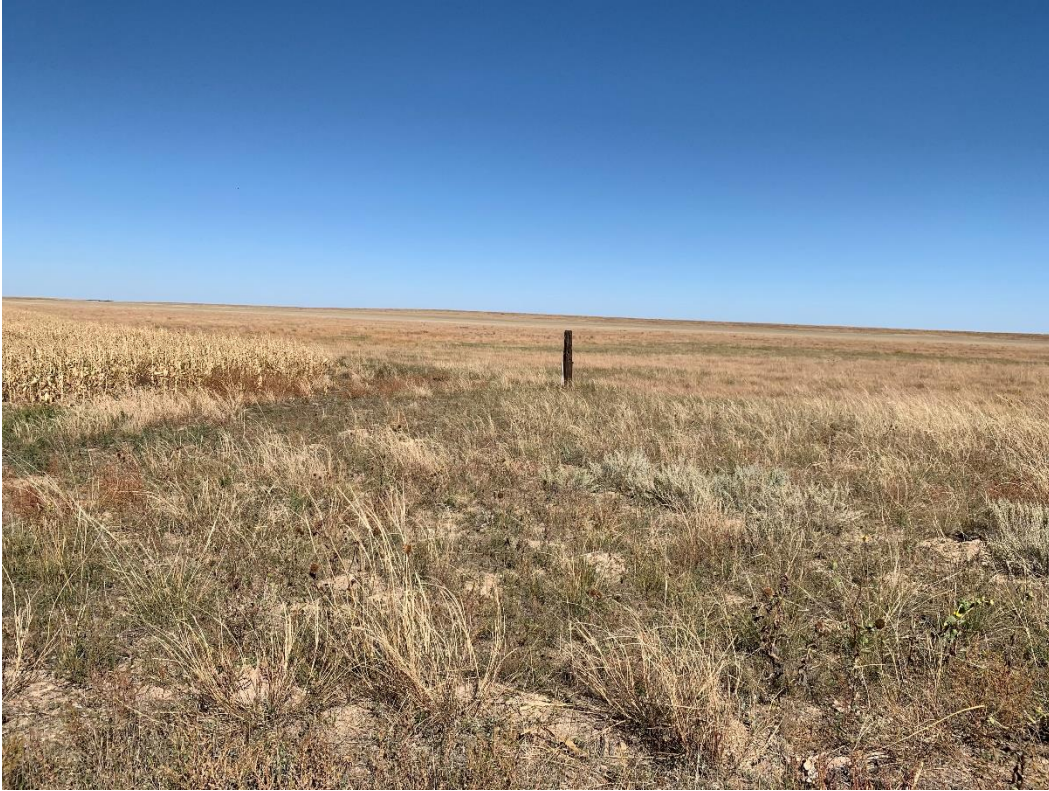
Boundary marker on the NE corner.