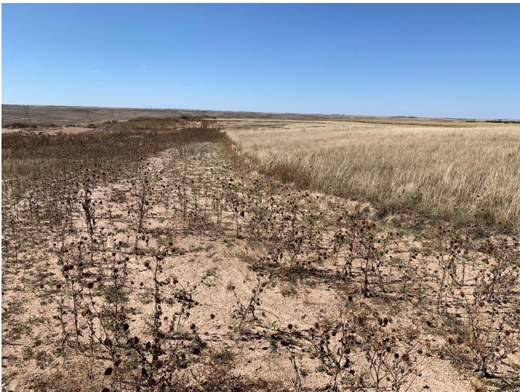
Topsoil salvaged in front of mining operations.