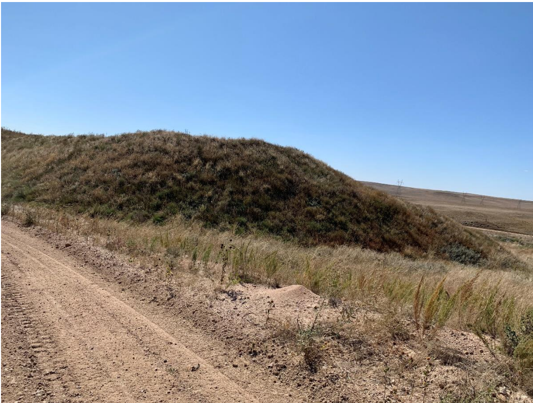
Topsoil stockpile on the west side of the permit area.