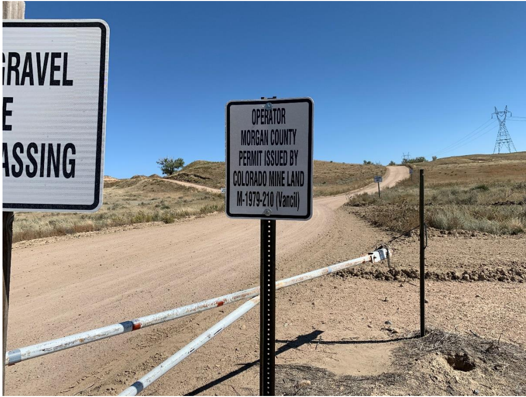
Mine entrance facing County Road 26