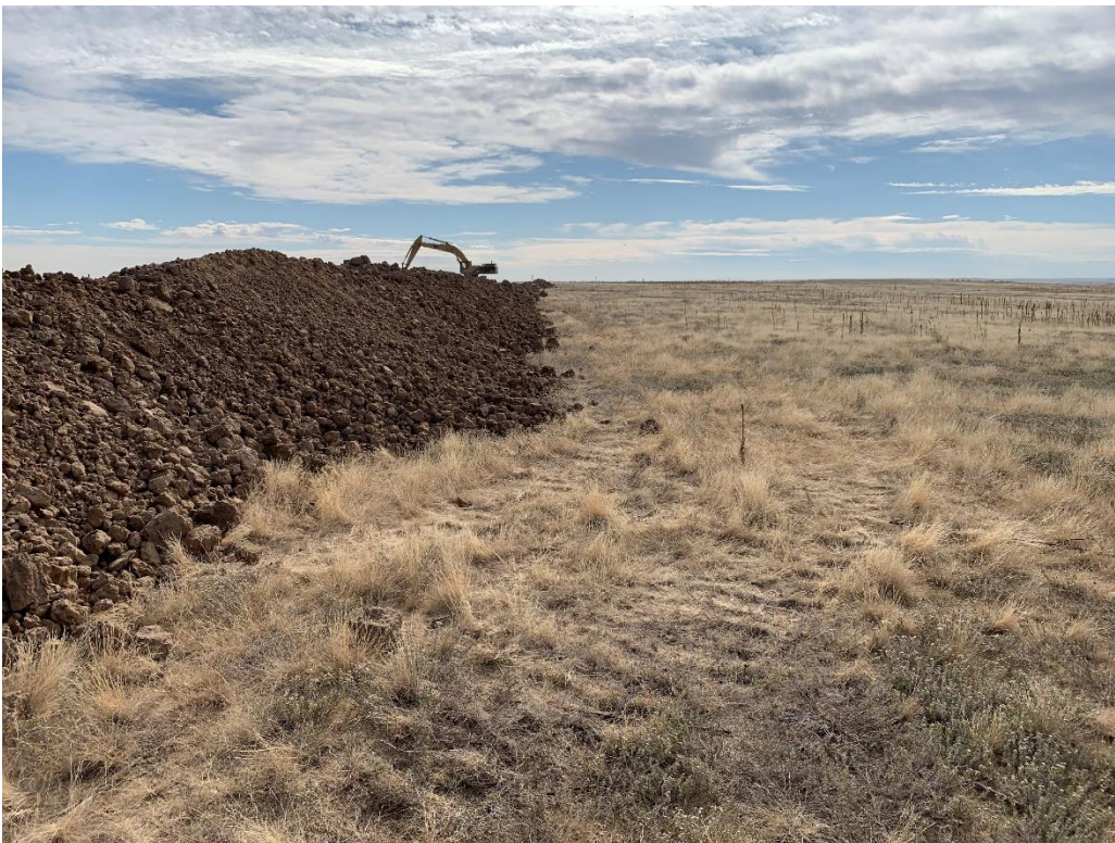
Undisturbed area above highwall that will be mined