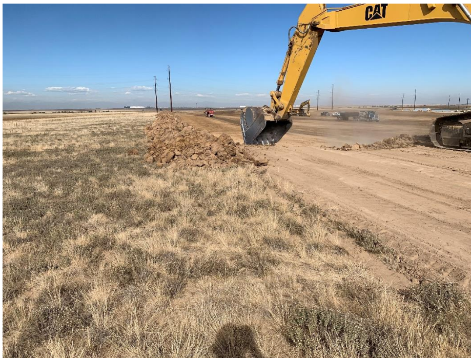
Excavator working on the highwall