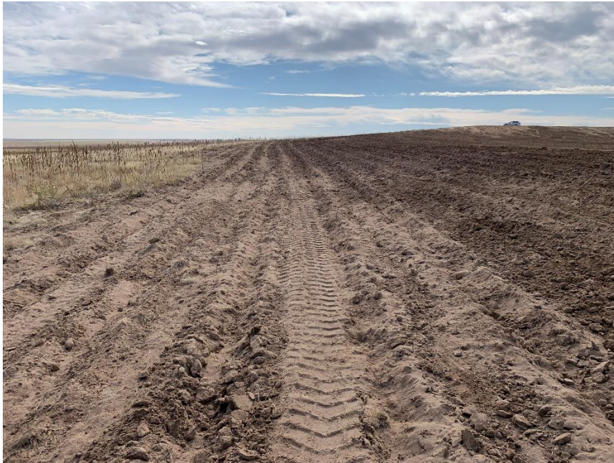
Area of reclamation