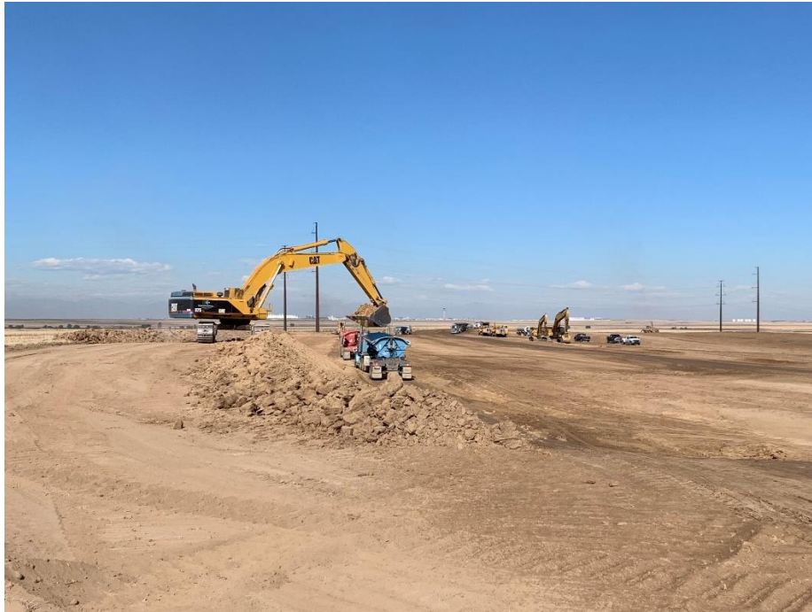
Loading material into road trucks