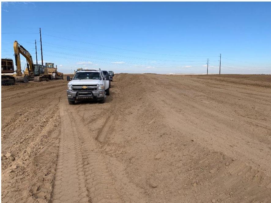
Topsoil stockpile to right of vehicles