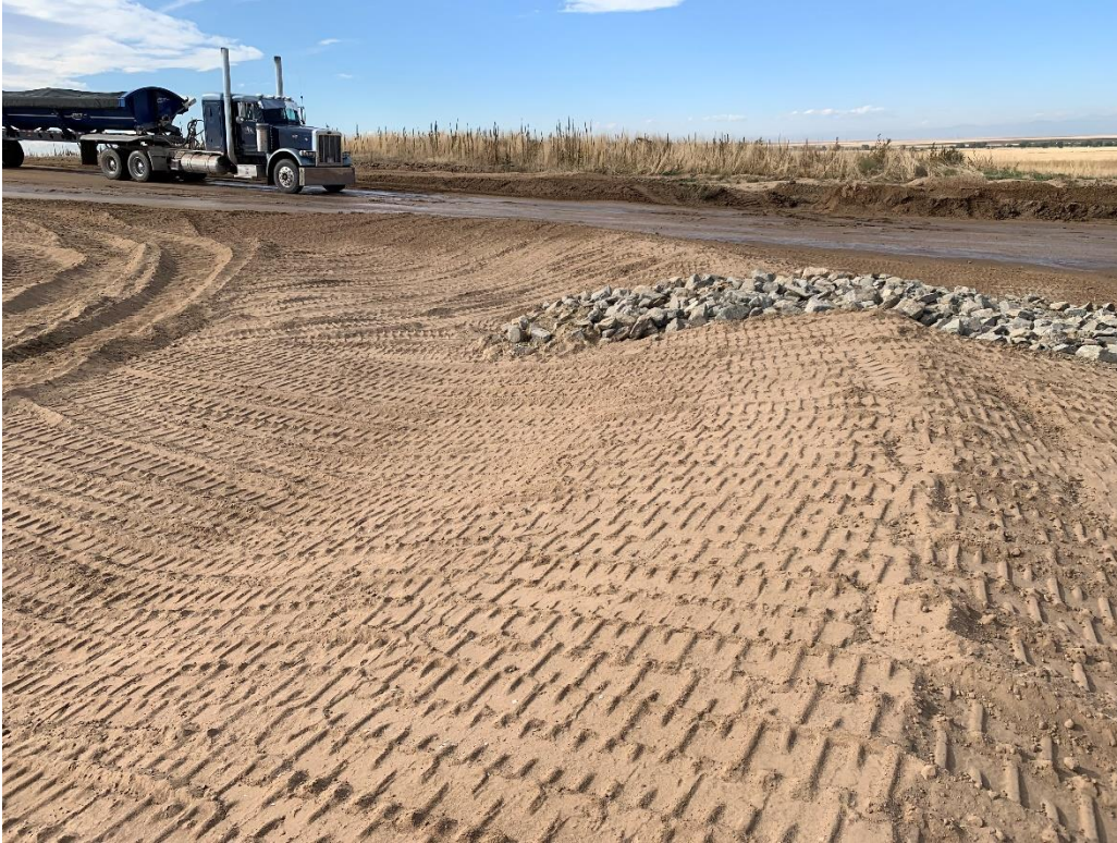
Catchment basin with rock lined spillway