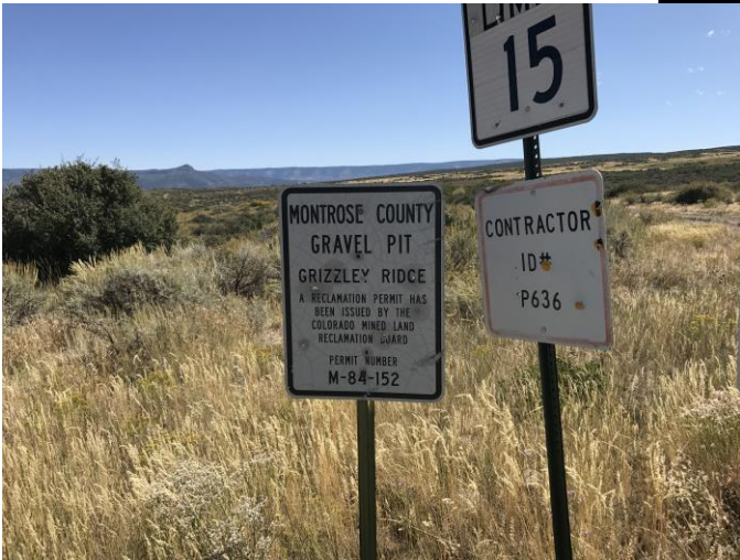
Mine ID sign