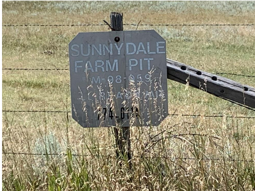
Mine entrance sign from County Road 23