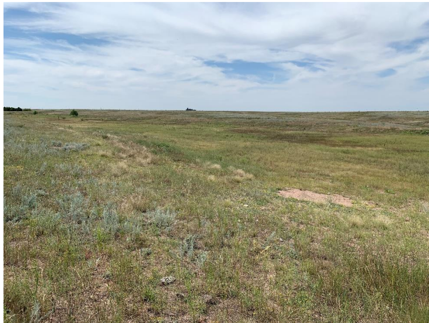
Northeast permit area of Frenchman Creek bottom looking southwest