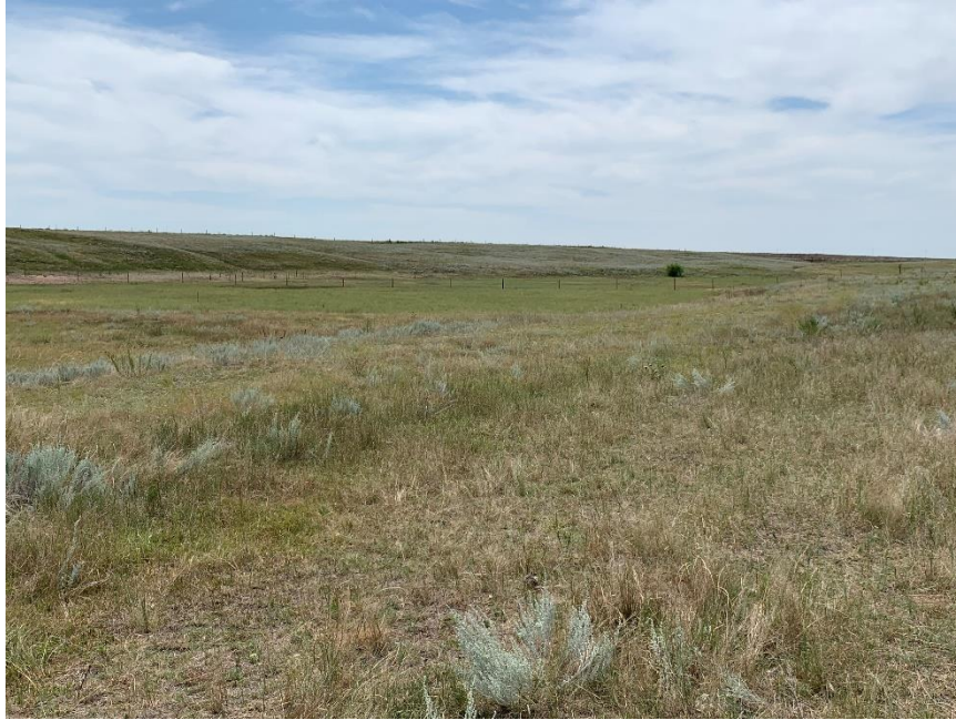
West end of permit area looking west at Frenchman Creek

Laurine Koellner L & L Ready Mix P.O. Box 218 Haxtun, CO 80731