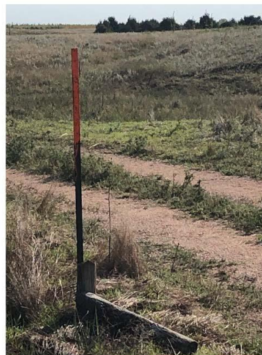
T-Post that replaces broken wooden post

Photo submitted by Operator to verify boundary marker t-post was installed.