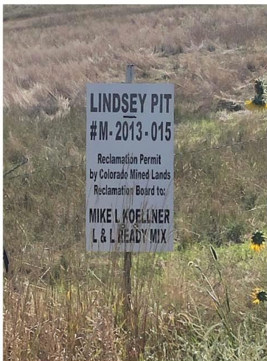
Lindsey Pit Sign