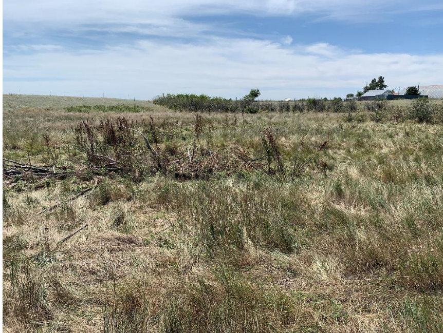
Canada thistle patch on east side of tree belt.