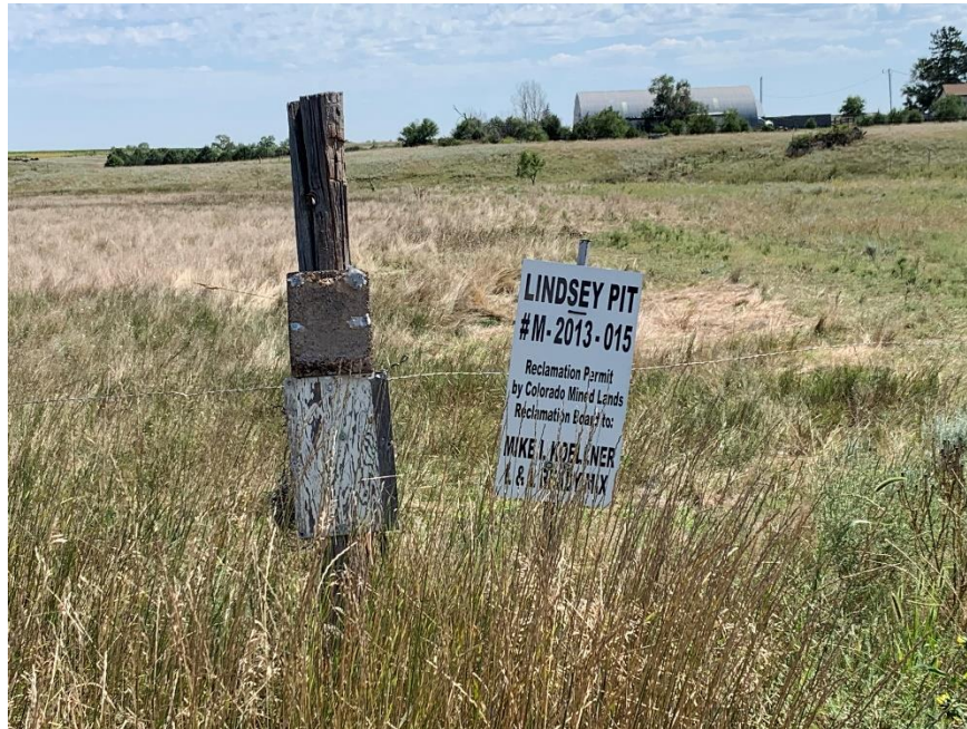
Mine entrance sign from County Road 7 facing east