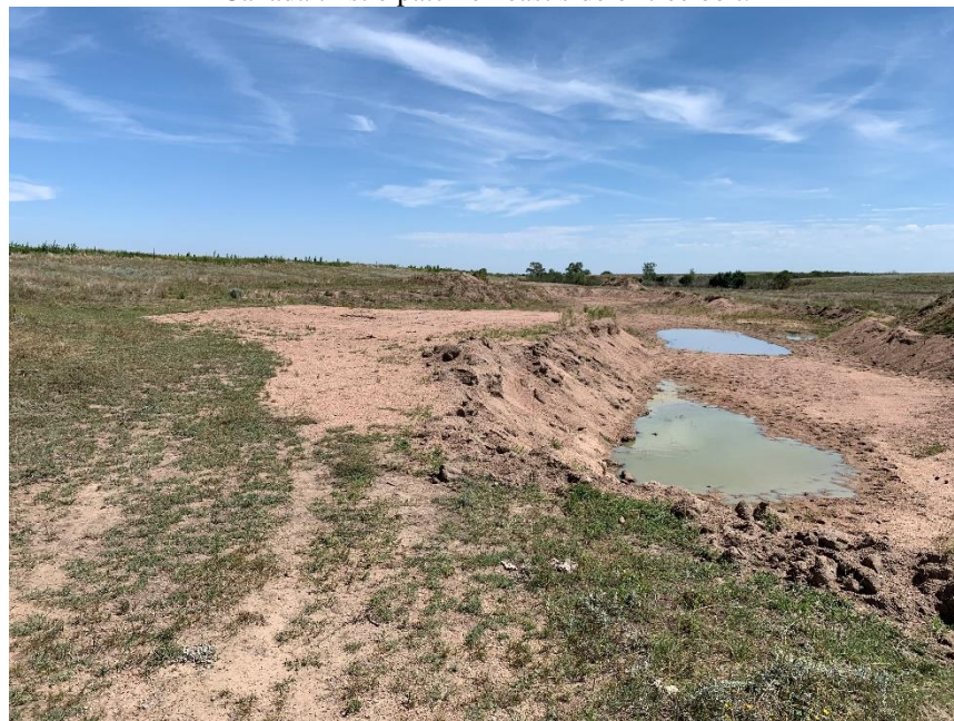
Pit area on east side of permit

Laurine Koellner Mike L. Koellner dba L&L Ready Mix 900 West Denver Holyoke, CO 80734