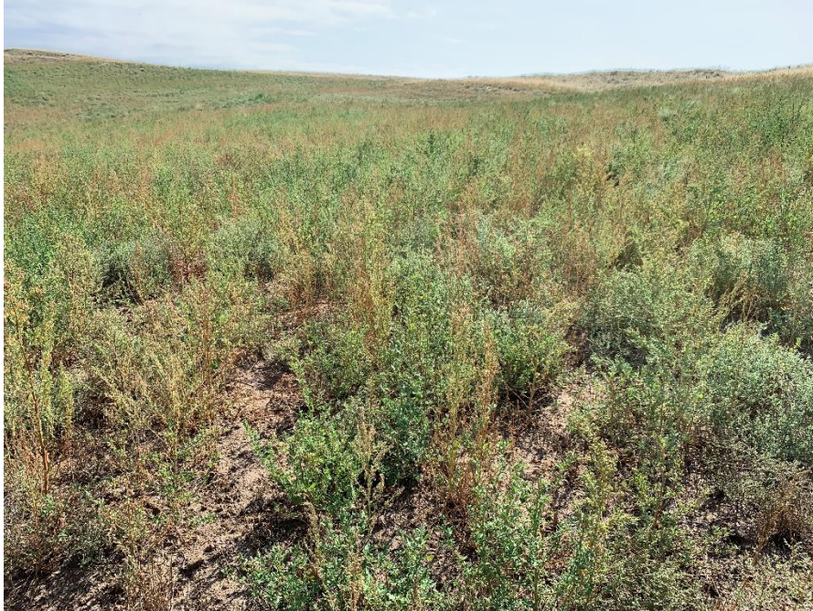
Vegetation mostly consisting of kochia and Russian thistle.