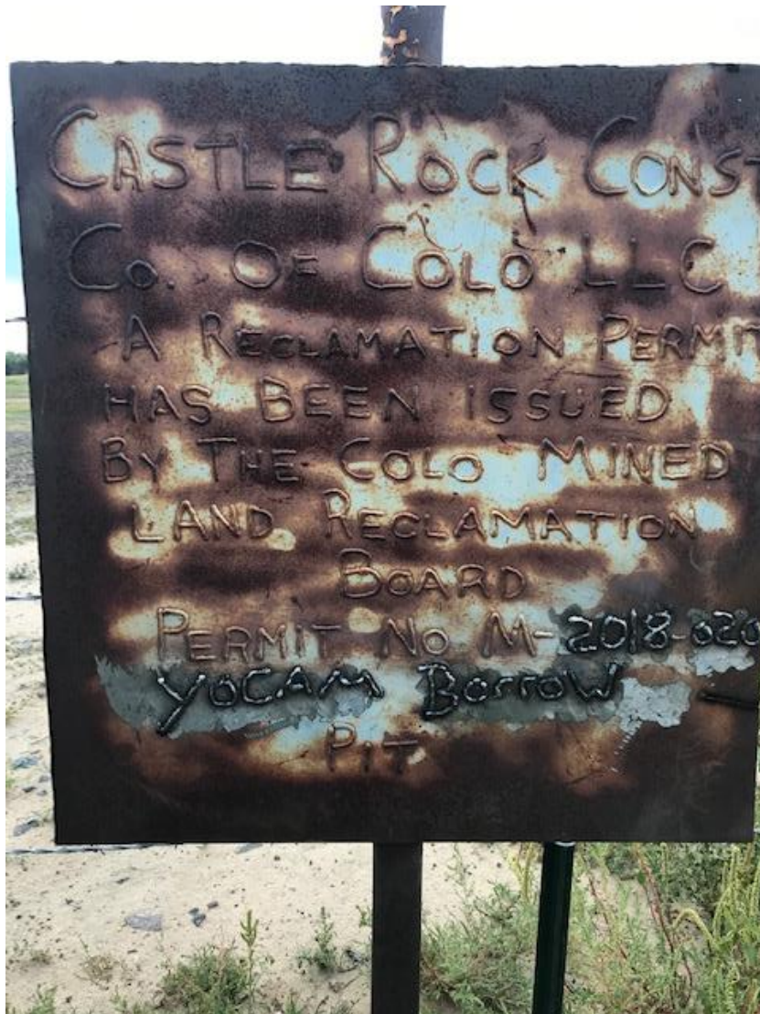
Mine entrance sign along CR 1/144.