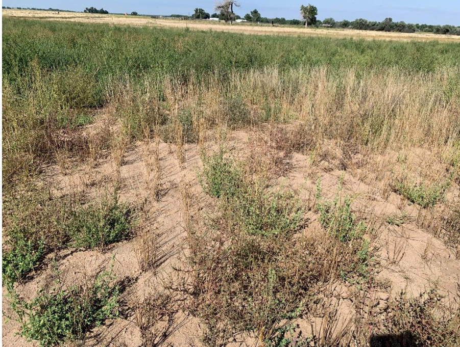
Oats plants planted in rows, have died at end of season.