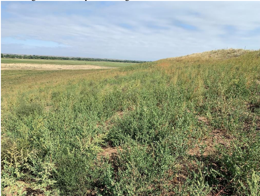
Slopes graded to approximately 4h:1v.