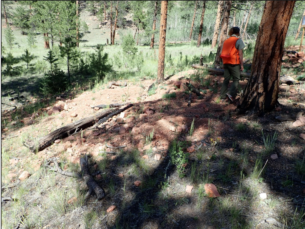
Photo 1. Prospecting trench currently in final reclamation; looking north.