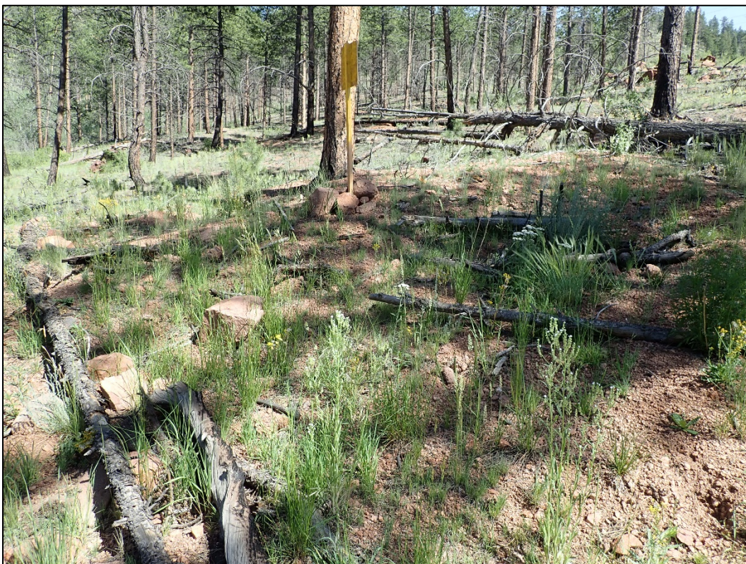
Photo 2. Prospecting trench currently in final reclamation; looking east.