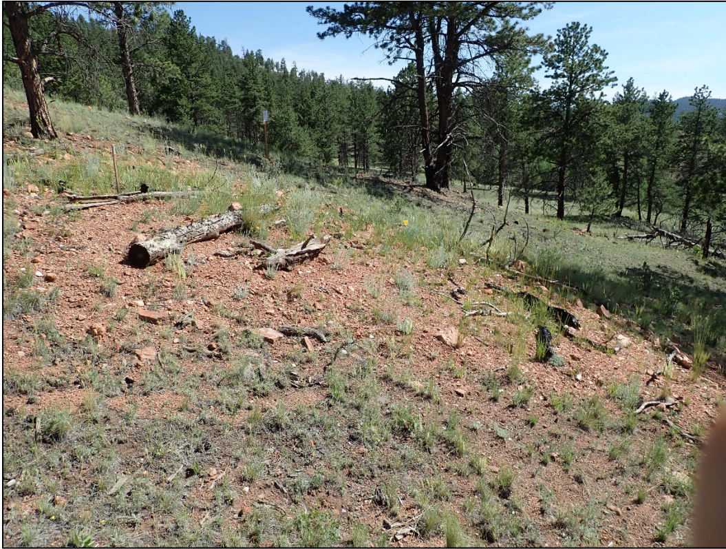
Photo 3. Prospecting trench currently in final reclamation; looking south.