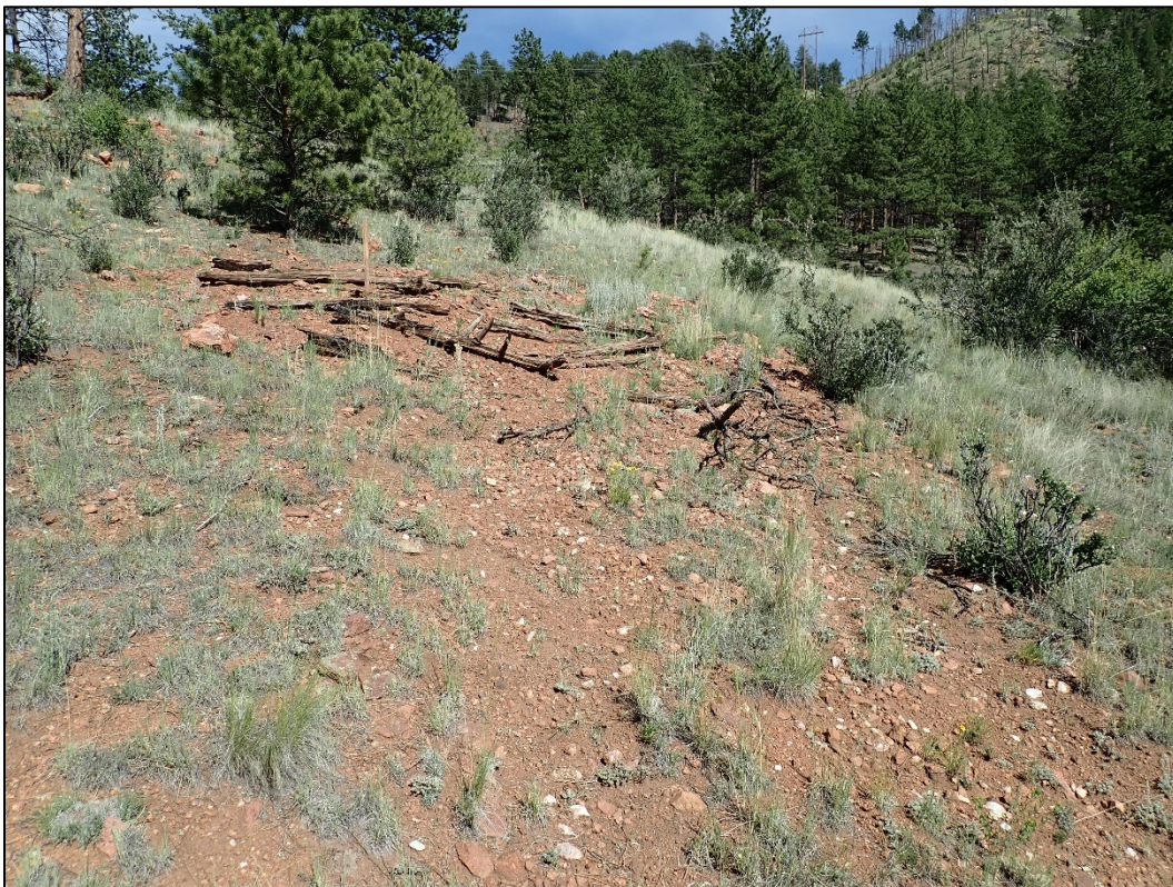
Photo 4. Prospecting trench currently in final reclamation; looking east.