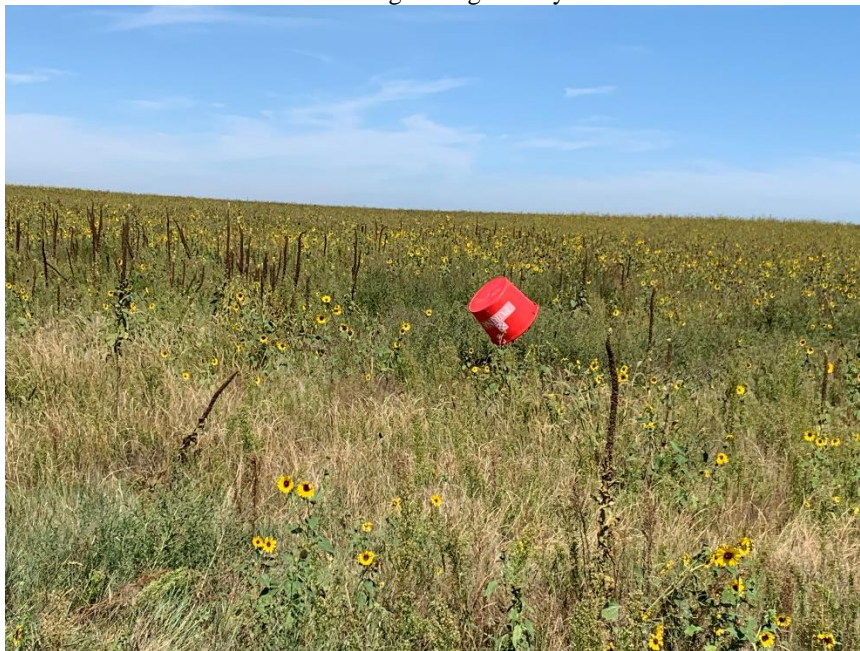
Permit boundary marker on northeast corner