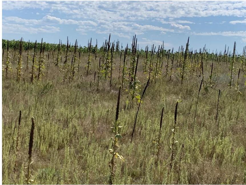
Mullein plants that need to be controlled