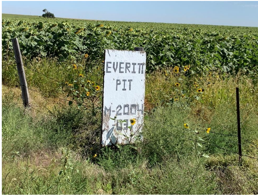
Mine entrance sign along County Road 16