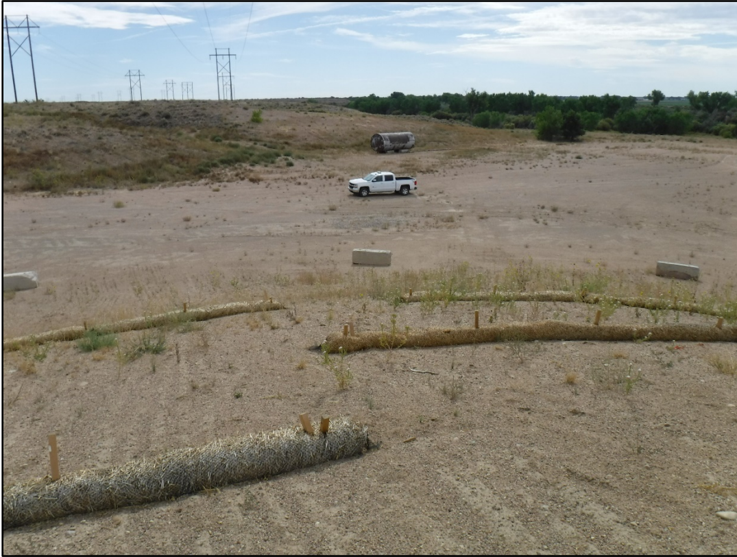
Photo 7: Graded slopes at base of power pole, note 2,000 gal AST center background