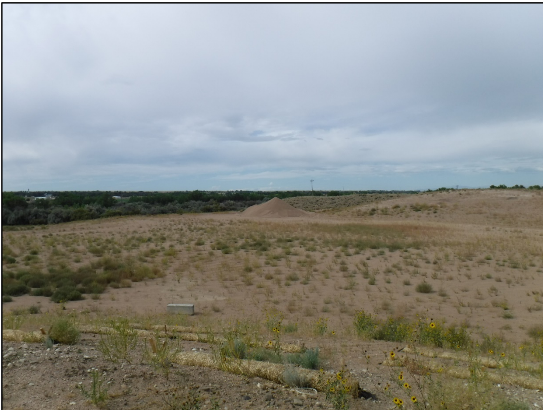
Photo 10: Lone stockpile near the southwestern corner of current permit boundary