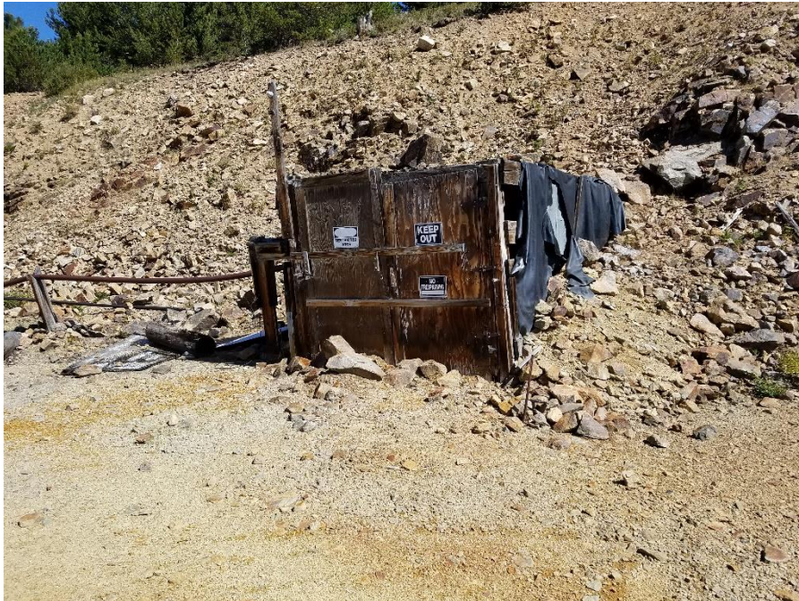
Figure 2. Portal