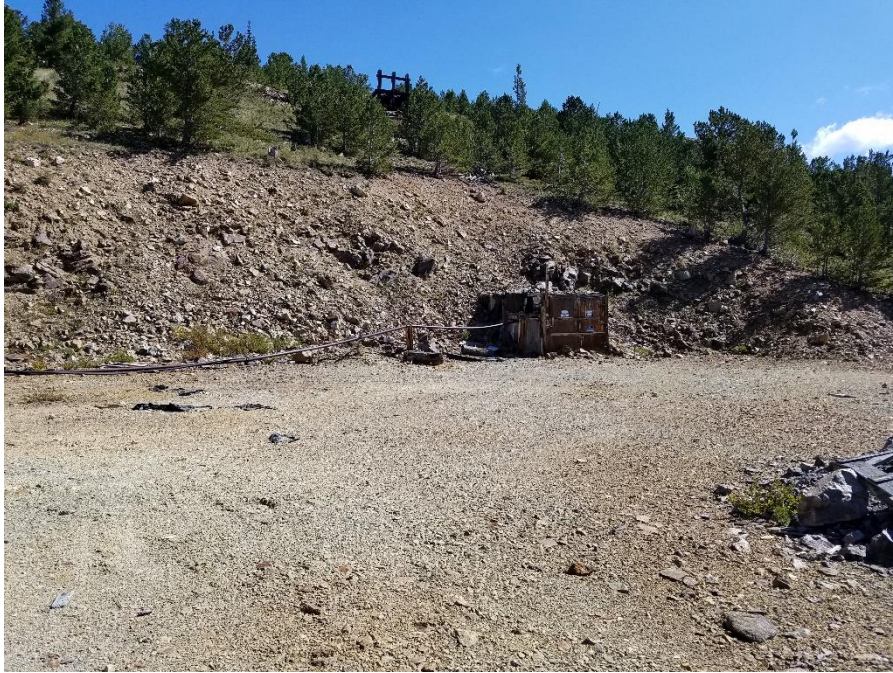
Figure 1. From the eastern corner of the site looking west.