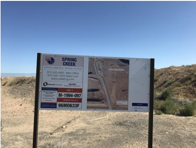
Mine ID Sign