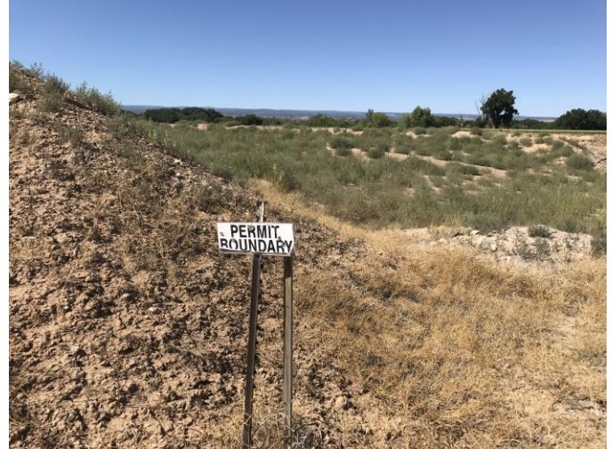
Permit NE Marker