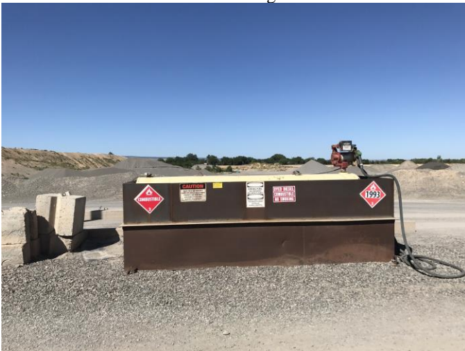
Fuel w Secondary Containment