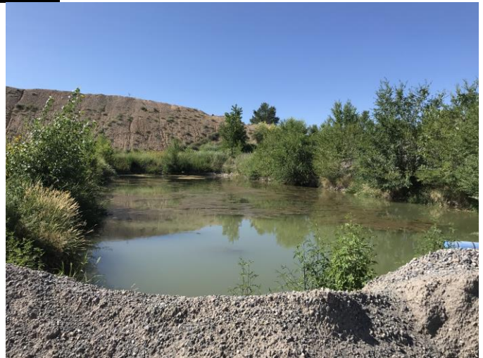
Irrigation Run off Pond